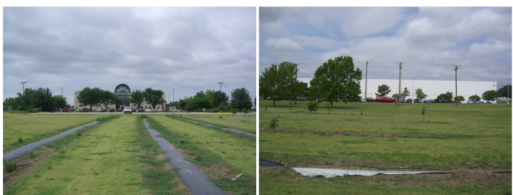
Fig. (9). Site photos for OKCW looking (a) north, (b) east, (c) south, and (d) west.