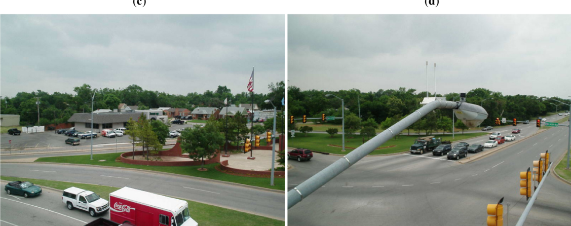
Fig. (2). Site photos for KNW105 looking (a) northwest, (b) northeast, (c) southeast, and (d) southwest.