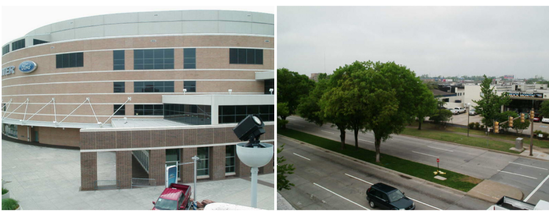
Fig. (3). Site photos for KCB109 looking (a) northwest, (b) northeast, (c) southeast, and (d) southwest.

structures. However, dispersed within the surrounding conditions are numerous vegetative patches, and the southwest corner of the intersection includes a vast open field (Fig. 4a-d ). The KSW109 site was classified the same as KNW105 and KCB109 but further demonstrates the complexity created by extensive urban vegetation near the stations which alter the local climate versus other I2, Do4, UCZ4, and Extensive Lowrise sites.