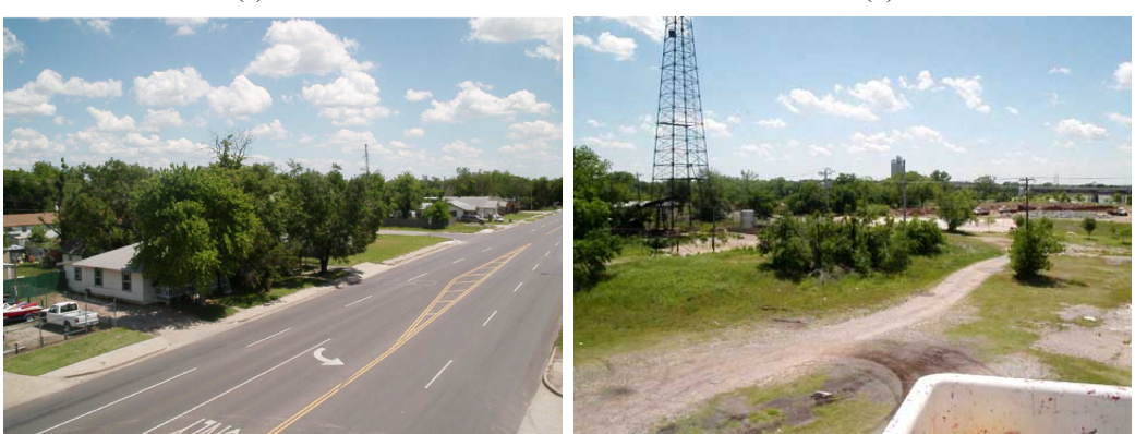
Fig. (5). Site photos for KSW105 looking (a) northwest, (b) northeast, (c) southeast, and (d) southwest.