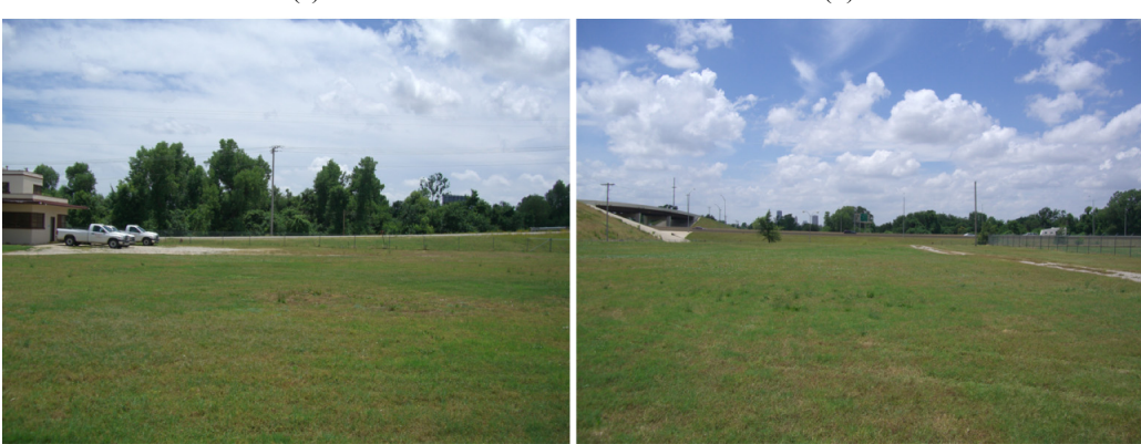
Fig. (10). Site photos for OKCE looking (a) north, (b) east, (c) south, and (d) west.