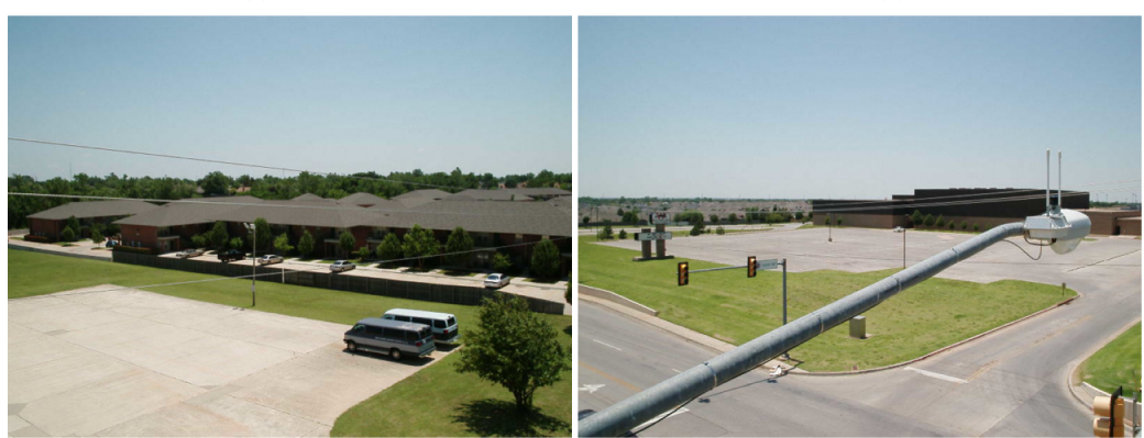
Fig. (7). Site photos for KSW112 looking (a) northwest, (b) northeast, (c) southeast, and (d) southwest.