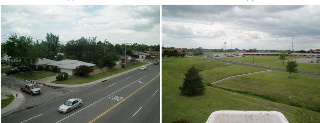
Fig. (6). Site photos for KSW111 looking (a) northwest, (b) northeast, (c) southeast, and (d) southwest.