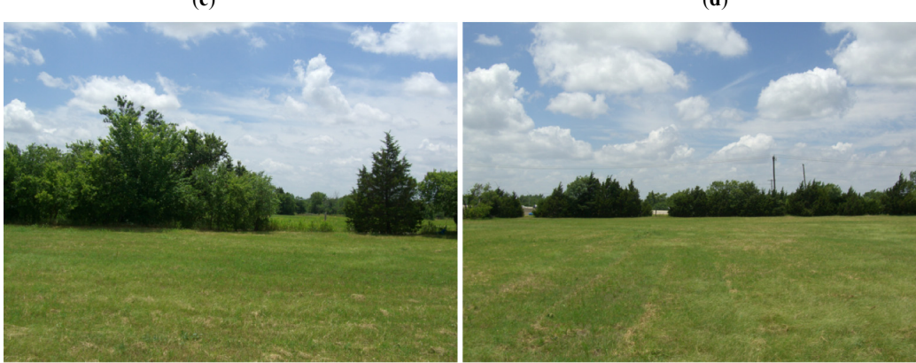
Fig. (8). Site photos for OKCN looking (a) north, (b) east, (c) south, and (d) west.