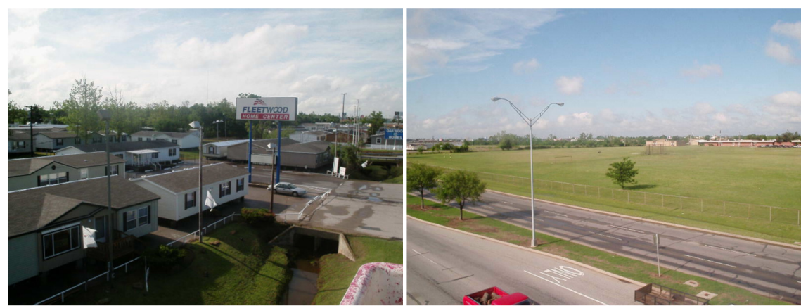
Fig. (4). Site photos for KSW109 looking (a) northwest, (b) northeast, (c) southeast, and (d) southwest.

atmospheric properties from regions not associated with the local microclimate.