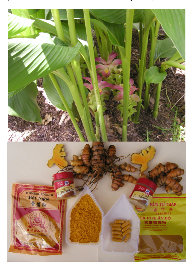
Fig. (1). Curcuma longa is primarily cultivated for turmeric rhizomes and their products (The upper picture shows the plants cultivated at the SFA Mast Arboretum, Stephen F. Austin State University in Nacogdoches, Texas, USA and the lower picture shows rhizomes and ground turmeric as well as curry powder.

Of 110 species of the genus Curcuma L., only about 20 species have been studied phytochemically [53]. Curcuma longa is the most chemically investigated species of Curcuma. To date, at least 235 compounds, primarily phenolic compounds and terpenoids have been identified, including diarylheptanoids (including commonly known as curcuminoids), diarylpentanoids, monoterpenes, sesquiterpenes, diterpenes, triterpenoids, alkaloid, and sterols, etc.