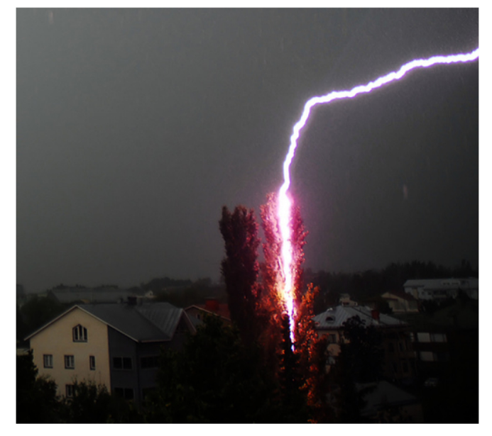
Fig. (1). Picture of lightning flash to nearby tree. No damage to the tree was observed. Picture is cropped from the full image shown in the Appendix.

One observer (Niklas Montonen) photographed a flash in Porvoo which hit a European aspen (Populus Tremula) less than 50 meters away. Fig. (1) is a cropped part of the full photograph. Based on location and timing, the flash could be uniquely tied to a -6kA flash with multiplicity 1. As in the case of [5], no damage whatsoever was observed to the tree, nor was any observed when the tree was rechecked in June 2008. As in [5], there had been a considerable amount of rain before the flash (15 mm in the three hours before the flash). According to the observer, the flash did cause a temporary break in cable TV service to the area.