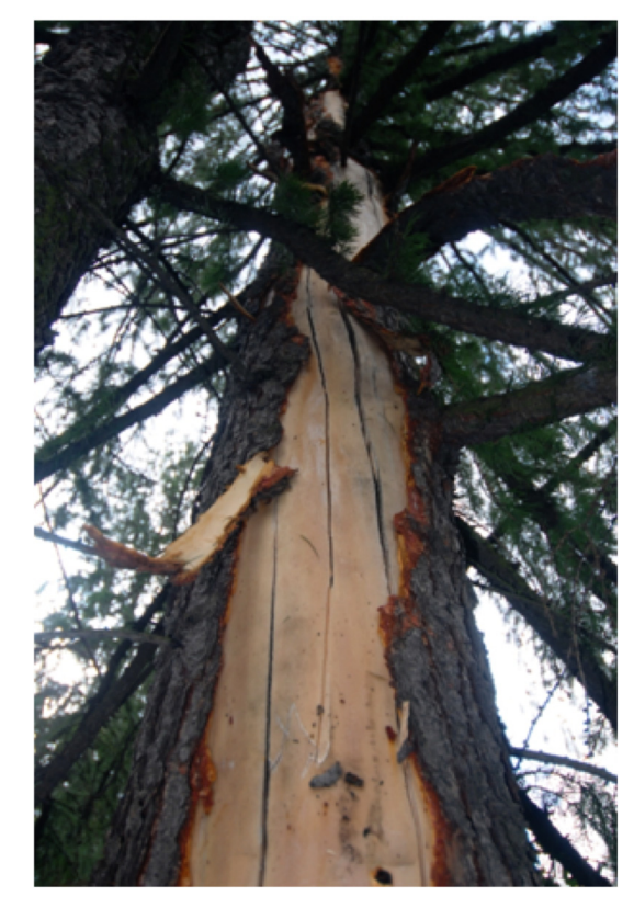
Fig. (5). Unusual bark-loss damage in a larch tree. A weak furrow can be seen in the ground. The tree also exhibits cracks along the grain.