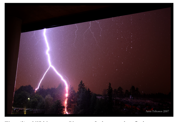
Fig. (2). Viikki case: Picture of three-stroke flash to trees.

damage; even the return stroke caused only minor bark-loss damage.