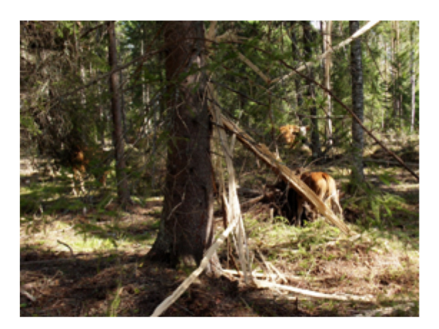
Fig. (6). Wood-loss damage to a fir tree.