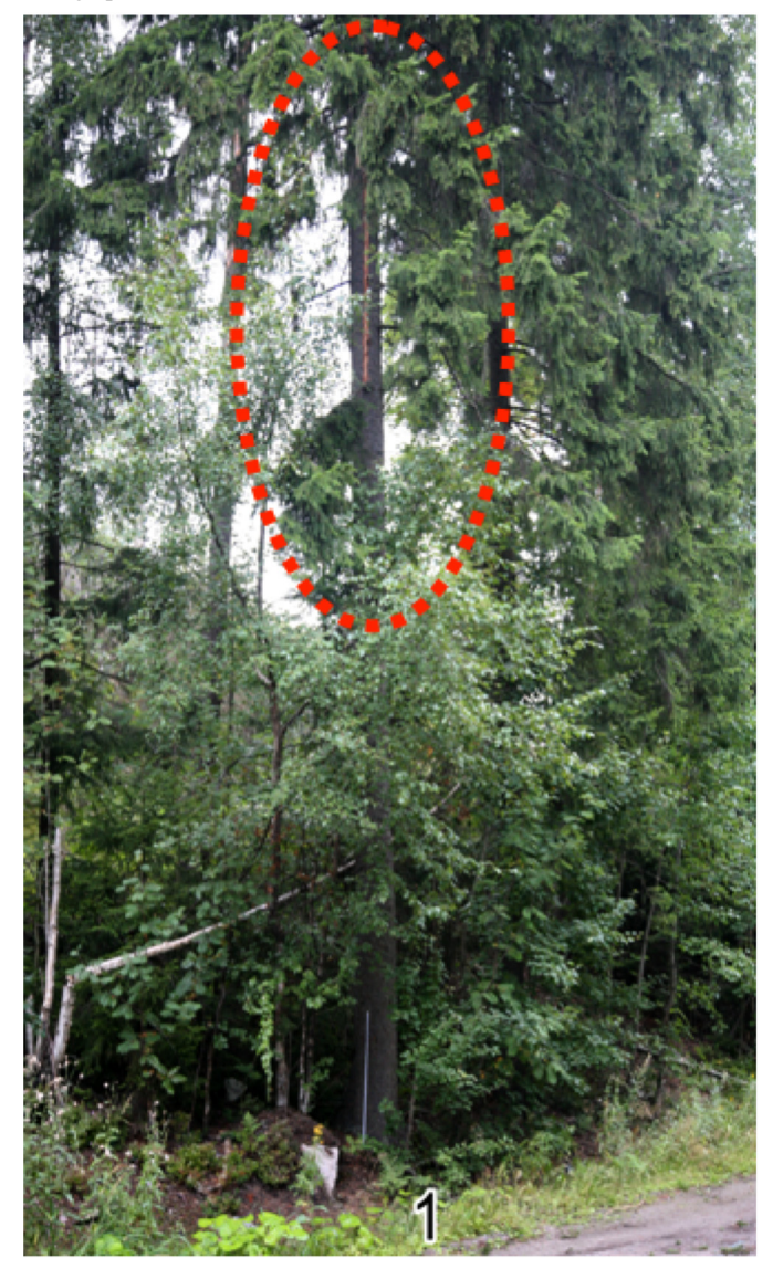
Fig. (3). Viikki case. Classical scar to the main struck tree above 6 meters. No damage to the tree with the attempted leader.