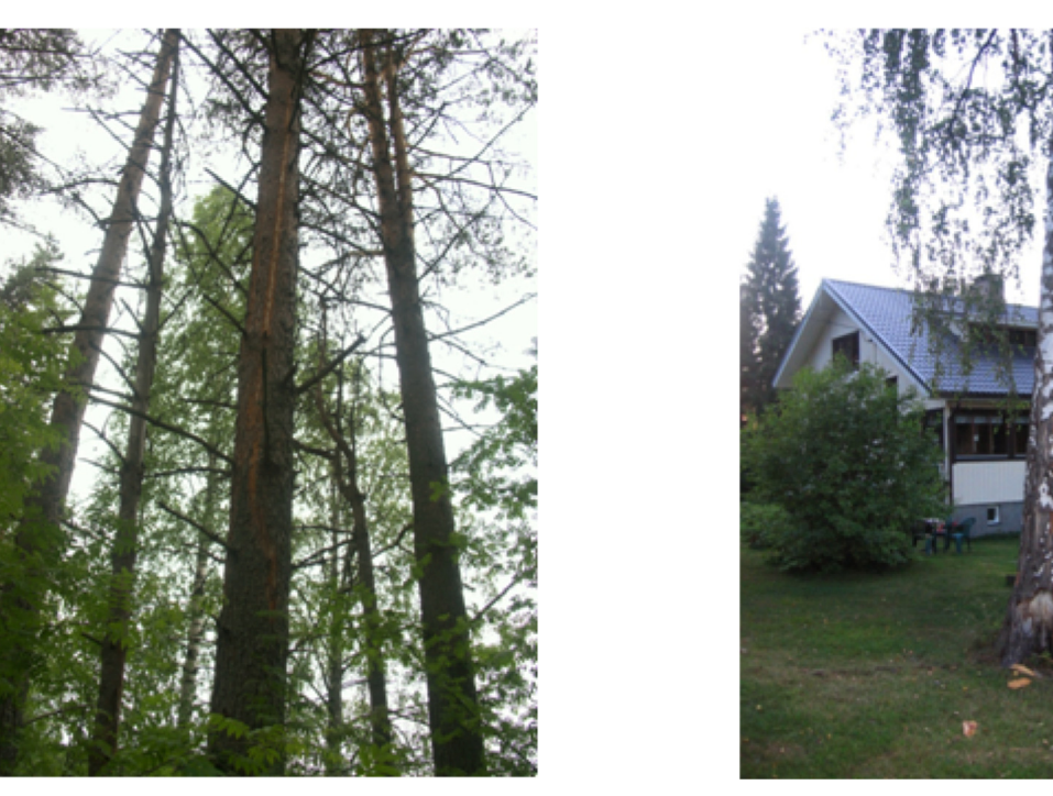
Fig. (4). Bark-loss damage in a fir (left) and birch (right).

loss cases and wood-loss cases were unambiguously separate. In the 2007 data collected by the "flash-based" method, a number of "anomalous" cases were found (Fig. 8). The mechanism causing the damage was clearly impulsive and the location fits with a flash observed by the lightning detection network, but cannot be identified as lightning