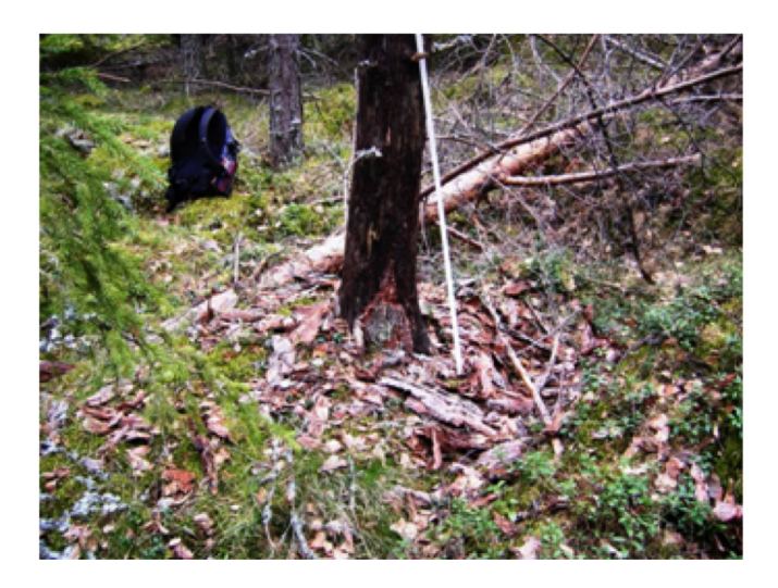
Fig. (8). An "anomalous" case. The bark has been disturbed by a strong impulsive force, but the mechanism cannot be identified as lightning with complete certainty. The lightning-detection network observed a flash at the location.

defined. If the tree was not within the zone of protection of another structure (tree or building), then the tree is the one that "should have been struck" and the parameter was given the value 1. If the tree was clearly within the zone of protection of another structure, then a value of -1 was given, and if the situation was unclear, the value was set to zero. This determination is unfortunately extremely difficult to make from photographs (or indeed on location). Nevertheless, the average value for the whole data set is 0.1. This implies that the tree height does not have a correlation with strike probability. However, due to the subjectivity of the analysis, more and better data will need to be collected.