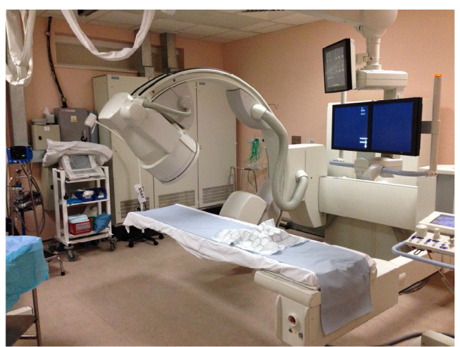
Fig. (3). Fluroscopy suite set up.

cancer induction risks based on the International Commission on Radiological Protection (ICRP 103, 2007) [7].