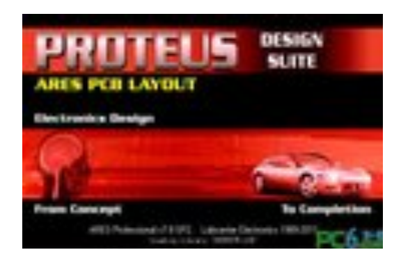
Fig. (1). Proteus software.

TEUS environment. The simulation schematic diagram should include display module, password inputting module, components connection and layout as well as the alert when inputting passwords. The components are connected as Fig. (2):