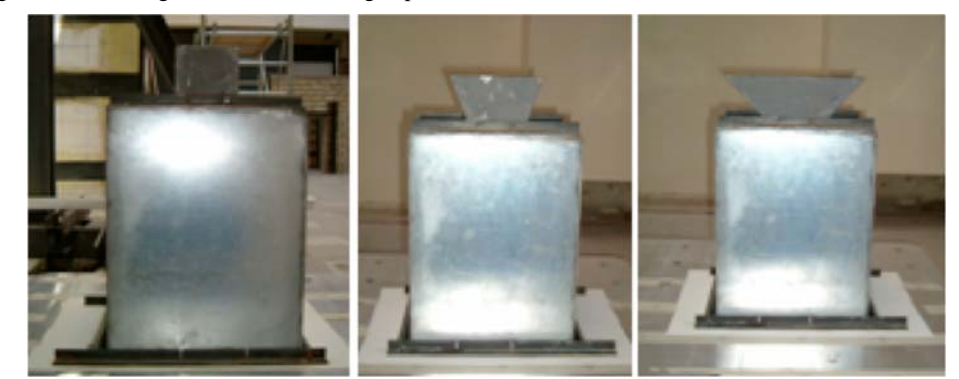
Fig. (3). Rigid structural prototypes with tanks of different shapes and liquid depths.

failures during a catastrophic event (eg. Earthquakes and hurricanes).