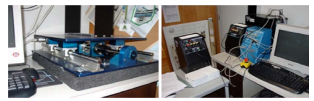
Fig. (5). Quanser shaking table II (and its controllers) at FEUP – Covicocepad Lab.

shapes with different degrees of inclination of their sides, filled in with different volumes of sloshing liquid.