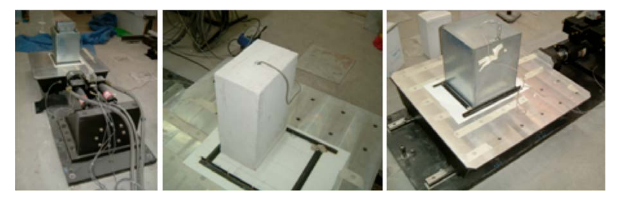
Fig. (2). The shaking table and the rigid blocks used during experiments.