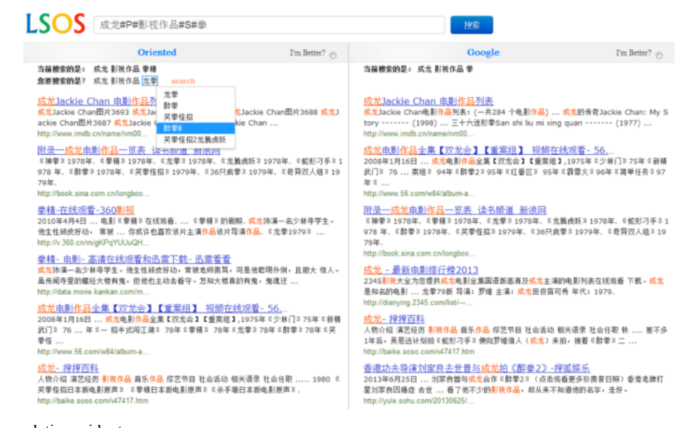
Fig. (4). The recommendation widget.

plex query of Wikipedia. A new search engine Koru would help guide the user interactively and would expand query automatically based on the structured knowledge, however the user would need relatively more operation time during this reciprocal process.