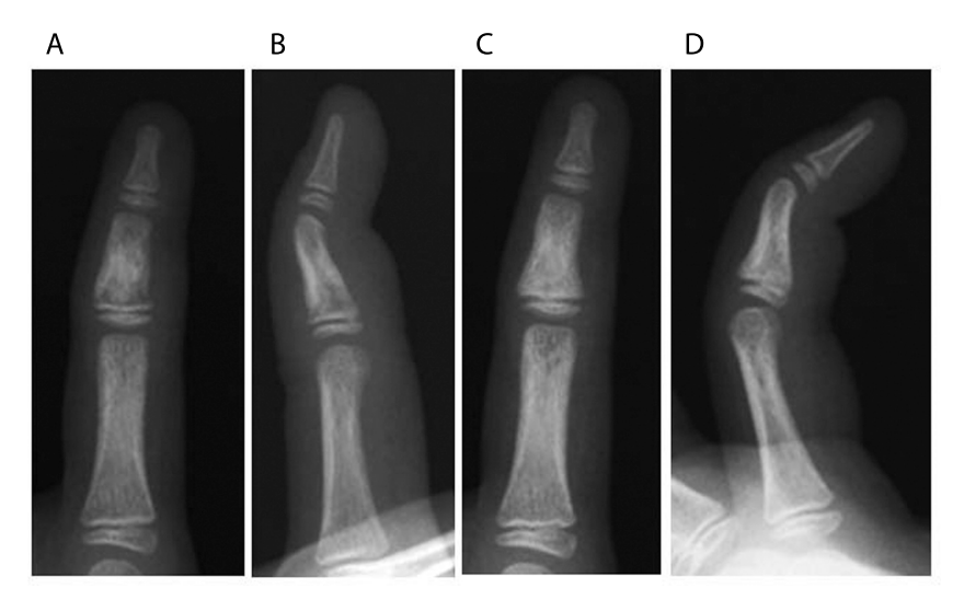
Fig. (4). Three months after symptom onset, less cortical irregularity is evident in the middle phalanx of the left index finger (A, B). Four months after symptom onset, no irregular shadows are apparent in the middle phalanx of the left index finger (C, D).

Fig. (3). Two months after symptom onset, an irregular shadow is seen on the middle phalanx of the left index finger, indicating pathological fracture (A, B).