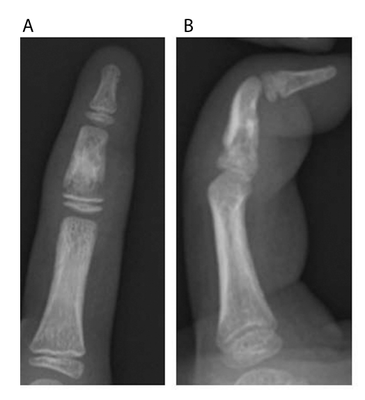
Fig. (3). Two months after symptom onset, an irregular shadow is seen on the middle phalanx of the left index finger, indicating pathological fracture (A, B).