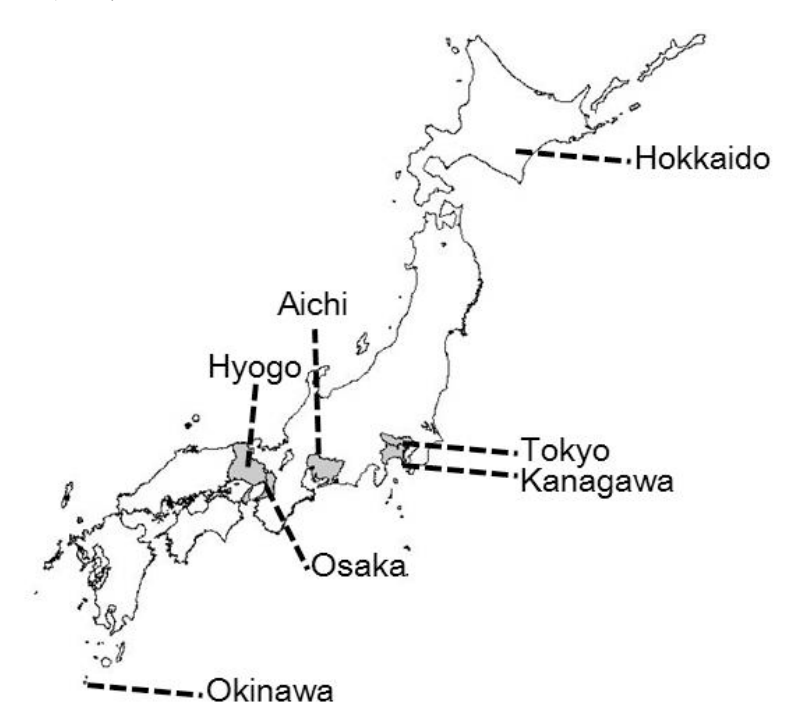
Fig. (1). Map of Japan, showing Aichi, Hokkaido, Hyogo, Kanagawa, Okinawa, Osaka, and Tokyo prefectures.

used to explore associations between them. All analyses were performed using the Statistical Package for the Social Sciences (SPSS) for Windows, ver. 15.0 [10].