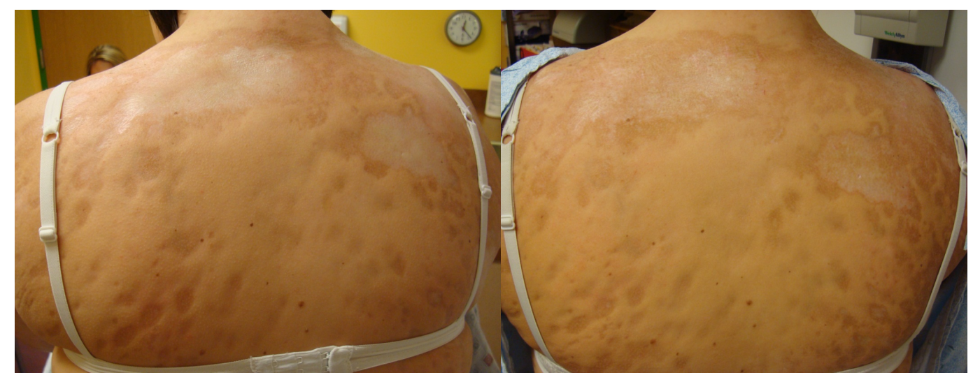
Fig. (2). Pre- and Post-treatment photographs of the upper back. The initial back lesions (a, left panel) demonstrate yellow/white waxy lesions with thick skin coalescing over her upper back. Post-treatment photographs (b, right panel) demonstrate decreased white/yellow waxy appearance of lesions, with less uniform skin thickness and 'breaking up' of lesions.