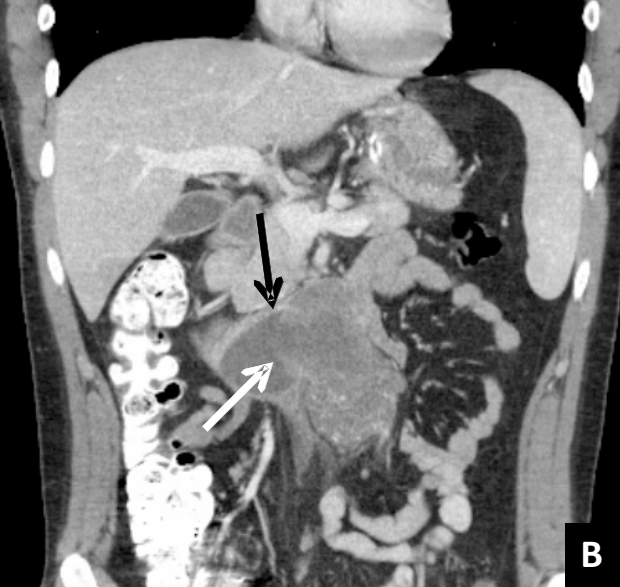
Fig. (1). A , axial enhanced CT image and B , coronal enhanced CT reconstruction demonstrate invasion of the duodenum by metastatic adenopathy from testicular cancer. The duodenal wall (black arrows) is disrupted by tumor (white arrows).