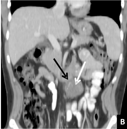
Fig. (2). After treatment, A, axial enhanced CT image and B, coronal enhanced CT reconstruction show interval reduction in mass size and development of punctate calcifications within the mass (white arrow). The duodenum (black arrow) is splayed around the mass but no longer dilated.

necessitating several days of nasogastric tube drainage, with subsequent resolution. Three years post-operatively, the patient is fully recovered without evidence of recurrent disease, and being closely monitored both serologically and radiologically.