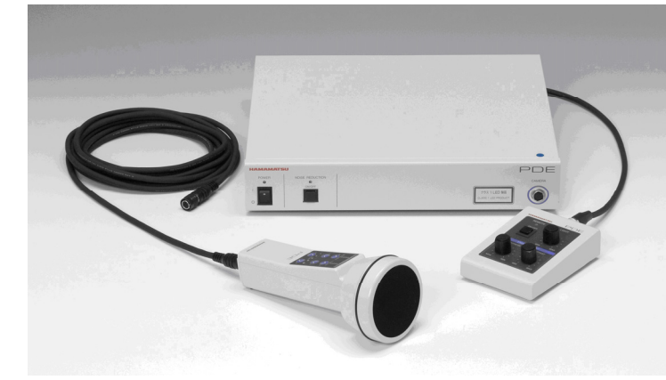
Fig. (3). External View of ICG fluorescence Imaging System (PDE).

ICG fluorescence method utilized near infrared fluorescence from ICG is expected as powerful medical diagnostic tool because of safe and cost effective technique. It's becoming popular at the breast cancer sentinel lymph node navigation application in Japan. This technique is also started to clinically applied to various surgeries, such as Cardiovascular surgery, Neuro surgery, Fetal surgery, Gastroenterological surgery and Plastic and Reconstructive surgery [5].