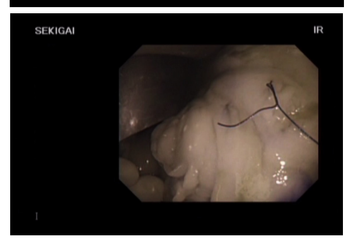
Fig. (1). A lymph node hardly recognized by the green color only (middle) or infrared imaging (lower) were easier to identify through dense fat by fluorescent imaging (upper).