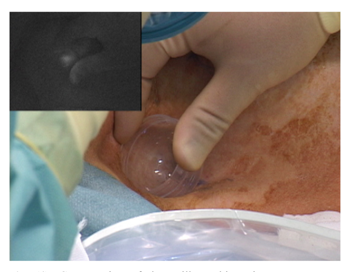
Fig. (4). Compression of the axillary skin using a transparent hemispherical device was effective for identifying the location of SLNs.

[22] reported that the rate of SLN detection using both ICG and fluorescence imaging was 94% and that the mean number of SLNs was 2.8. Our previous study [23] showed that the detection rate achieved with ICG and fluorescence imaging was 100%, and that the mean number of SLNs was 5.4. The present study showed that the detection rate was 98.7% and the mean number of SLNs was 3.7. However, with ICG alone, the detection rate was 69.3% and the mean number of SLNs was 2.3. These results were similar to those of Motomura et al. for the use dye alone without fluorescence imaging. In general, the detection rate using radioactive colloid has ranged from 87% to 98%, with a mean of 92.3% [4-6, 8, 9, 11]. The introduction of fluorescence imaging has yielded a detection rate equal or