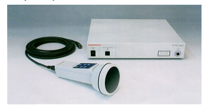
Fig. (1). The photodynamic eye apparatus.