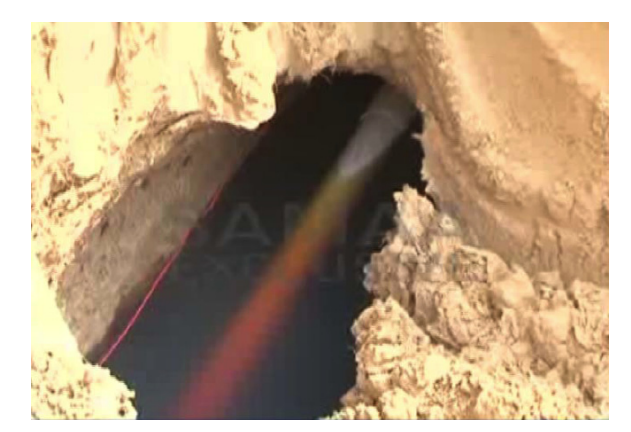
Fig. (4). Wastage of oil cargo from the underground pipelines.

At the end it is hoped that the Law Department of the Government of Pakistan and the relevant concerned Authori-