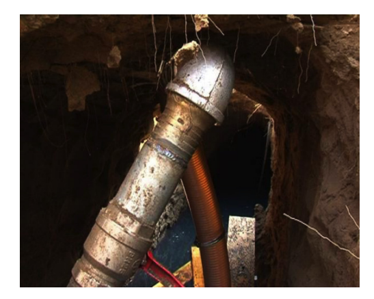
Fig. (6). Pilferage of oil during discharging of oil cargo.

ties will pay the required attention to take some immediate steps suggested as follows: