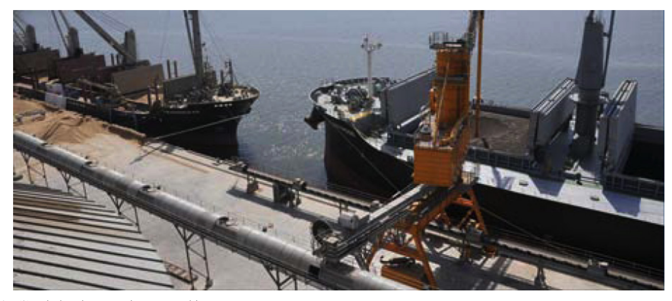
Fig. (2). Discharging operation at Karachi port.

cannot be brushed aside on the basis of a myth that due to the constant movement of the ship on account of the waves of the sea the ullages are entirely unreliable, as has been held in the case of Lady Helene [10]. The Collector of Customs challenged the said decision of the Division Bench in the Supreme Court of Pakistan in the case of Collector of Customs v/s Fatima Enterprise which was pleased on 4.11.2003 to direct that [11].