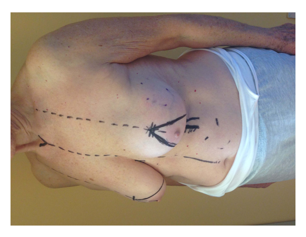
Fig. (12). Superior-medial pedicle reduction mammoplasty technique for left upper-outer quadrant breast cancer - Preoperative photo.

Fig. (11). Superior-medial pedicle reduction mammoplasty technique for left upper-outer quadrant breast cancer - Preoperative photo.