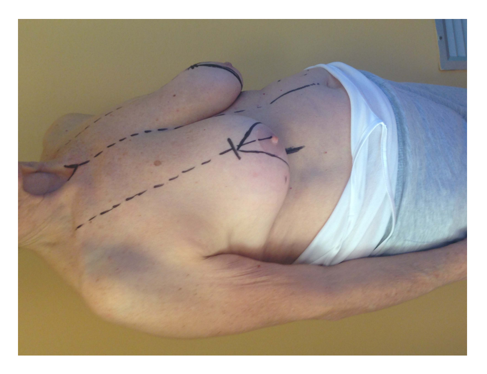
Fig. (11). Superior-medial pedicle reduction mammoplasty technique for left upper-outer quadrant breast cancer - Preoperative photo.