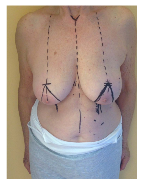
Fig. (10). Superior-medial pedicle reduction mammoplasty technique for left upper-outer quadrant breast cancer Preoperative photo.

This quadrant can be described as the easiest to approach. In fact, bulky lesions may be excised using standard techniques of BCS without resulting in any breast deformity. Nevertheless, if more than 20% of breast tissue has to be removed, overlying skin may retract causing NAC migration toward ipsilateral axillary region Figs. (10-15). In this quadrant we can perform a racket mammoplasty which results in a radial cicatrix above the breast carcinoma location extending to the areola area, with repositioning of the nipple areola complex in the right site [14].