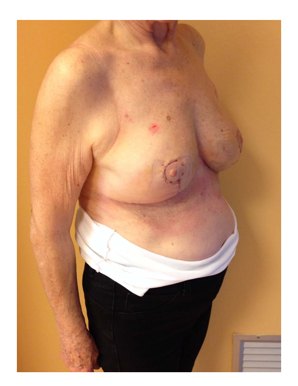
Fig. (15). Superior-medial pedicle reduction mammoplasty technique for left upper-outer quadrant breast cancer - Results at 7 days.