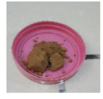
Fig. (3). Henna leaves powder.

also utilized in baking to assist the incorporation of fat into the dough and to let the formulation stay soft. Gum arabic or gum acacia is the dried gluey exudate obtained from the stem and branches of a tree, African nation (Linne) Willdenow and different connected species of acacia (Family Leguminosae). The gum has been recognized as associate degree acidic saccharide containing D-galactose, L-arabinose, L-rhamnose, and D-glucuronic acid. Tree is especially utilized in oral and topical pharmaceutical formulations as a suspending and emulsifying agent, typically together with gum. It is conjointly utilized in the preparation of pastilles and lozenges and as a pill binder [18 - 20].