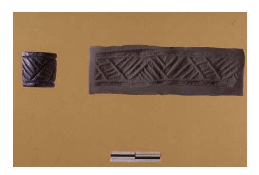
Fig. (2). Cylinder seal.

The cylinder was rolled over wet clay to mark or identify clay tablets, envelopes, ceramics and bricks. It covered an area as large as desired, an advantage over the earlier stamp