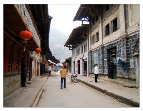
Fig. (1). Interface relationship of the old street.