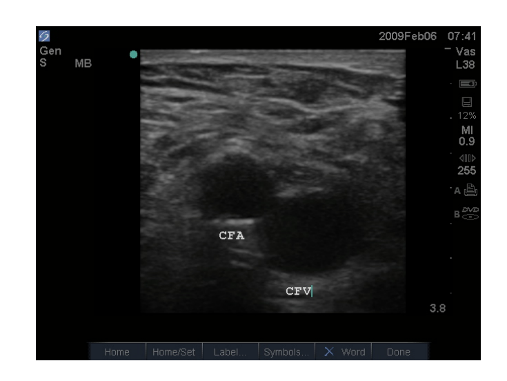
Fig. (4). Peanut Sign : The CFA lies next to the common femoral vein which looks like a "peanut."

We begin our exam just above the GSV-CFV junction. At this level the examiner should locate the CFA-CFV in transverse plane. It is sometimes referred to as a "peanut sign" (Fig. 4).