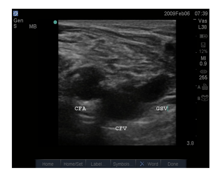
Fig. (1). Greater Saphenous Vein (GSV) and Common Femoral Vein Junction. Notice the GSV entering the CFV. This is the point where we begin our compressions.

The main question is which CUS technique to employ; a complete or limited two-point compression exam. In a complete exam you compress at approximately 2cm segments over the entire proximal venous system to the trifurcation of the popliteal veins. In the two-point compression strategy the common femoral vein is compressed at the level where the great saphenous vein enters; then the popliteal vein is compressed (Fig. 1).