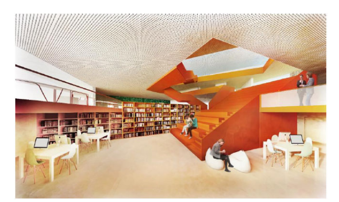
Fig. (5). Internal view of the library.