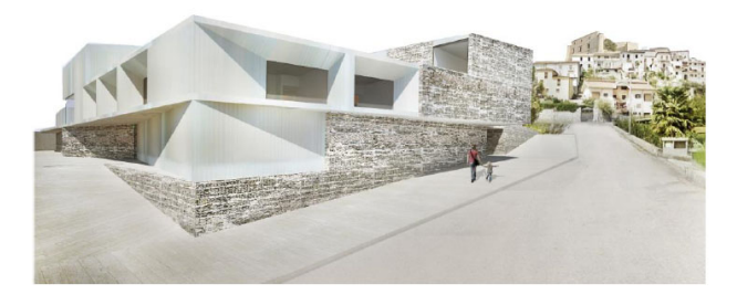
Fig. (1). Front view of the school building.

The new school building is designed as a Civic Center, an urban place characterized by spaces of relationship. There is an articulated system, in which the nursery school is in immediate contact with the garden and the educational gardens, but also connected to a large atrium, where the auditorium, the canteen and the laboratories are located. This unitary space is both a space for great events and domestic space, sub dividable and usable in everyday life. At the same altitude, the system of open and covered spaces is connected to the existing gymnasium, incorporated into the new system. From the atrium it is possible to descend towards the library and to go up towards the elementary school and then to the middle school. The rotation of the superimposed levels makes possible to create terraces and outlooks, which, together with the inclined roof, define the characteristics of an articulated building immersed in the green spaces, which recalls the castle and the hill. The idea is to have a building in the park. This fundamental goal is pursued in relation to the general aims of the "Innovative Schools" competition with respect to which specific answers have been elaborated and summarized in the proposed solution. However, these specific answers can be explored, identifying some specific themes [2 - 10]. Figs. (1 and 2) propose front views of the school building under consideration.