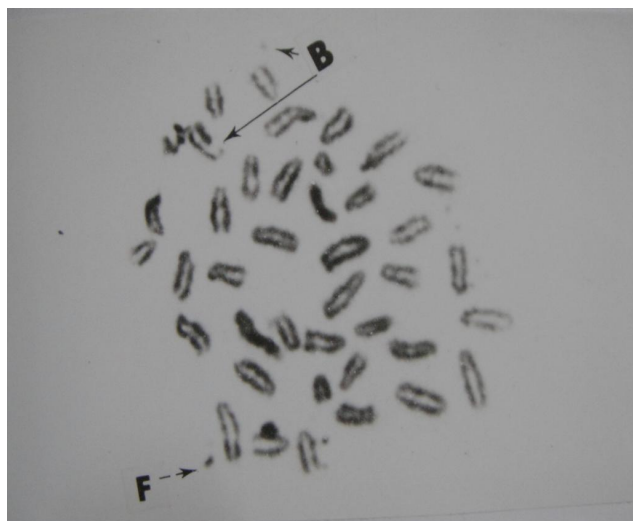
Fig. (1). Metaphase spread from mouse bone marrow cells showing chromosomal aberrations after injection with DMN.

DMN-induced chromosomal aberrations consisted mainly of gaps and breaks (Fig. 1). Cells with multiple chro-