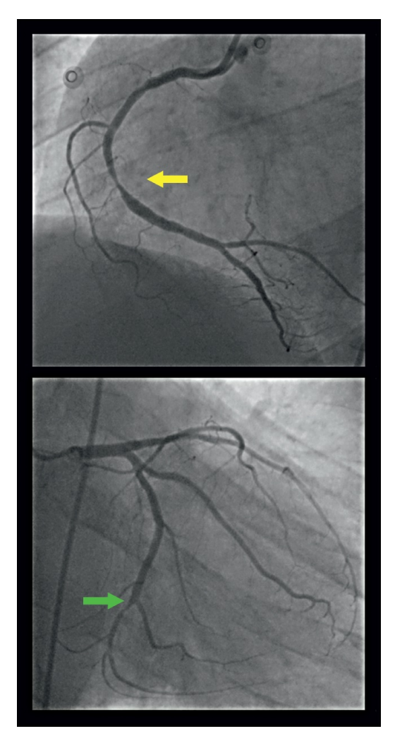
Fig.(2). Coronary angiography. A. Right coronary artery with 80% stenosis. B. Left circumflex with 75% stenosis.

Coronary angiography revealed 80% stenosis in the RCA and 75% stenosis in the left circumflex artery. (Fig. 2) Neither thrombus, nor angiographic evidence of plaque rupture was detected. During coronary angiography, the patient received intracoronary nitrites without improving the angiographic grade of the stenosis. The patient underwent PCI of the RCA lesion using a 3.5x15mm drug eluting stent with good angiographic result and TIMI III flow. The ST-segment elevation improved after coronary angioplasty. The patient remained hemodynamically stable in the coronary care unit without arrhythmia, and was discharged four days later. Echocardiography showed normal left ventricular dimensions with inferior and posterior wall motion abnormalities (ejection fraction 45%).