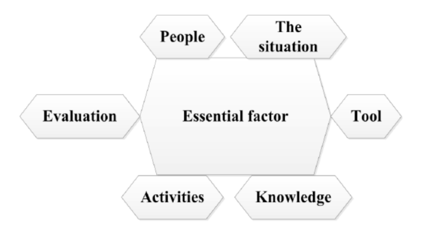
Fig. (3). Elements of personal learning environment.

We believe that PLEs is a group of six, including six elements, namely: the personal learning environment factors (PS, KG = PLEs, TS, AV, CT, EN), as shown in Fig. (3).