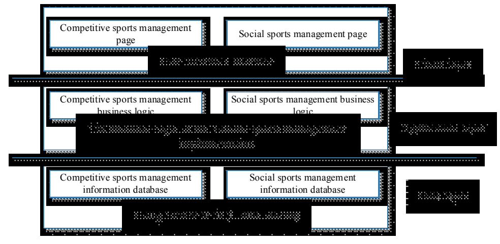
Fig. (3). The structure and flowchart of the proposed system.