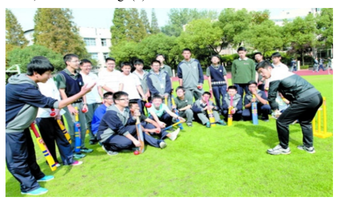
Fig. (1). Characteristics of physical education teacher-student interaction.

Physical education teaching is a special teaching method. The teaching process is a kind of teaching, learning and practice. Students through the process of practice, not only to master of sports and health care knowledge, technology and skills, also make the physical and mental exercise and development [8]. This teaching, interaction of teaching mode, makes it easier for the students and teachers to be integrated. It also laid the foundation of communication between teachers and students. The harmonious development of the relationship between teachers and students in physical education, but some teachers are not good at using this resource [9]. For example, in the end of the lecture, the demonstration layout of the task, do not take the initiative to integrate into the students, as shown in Fig. (1).