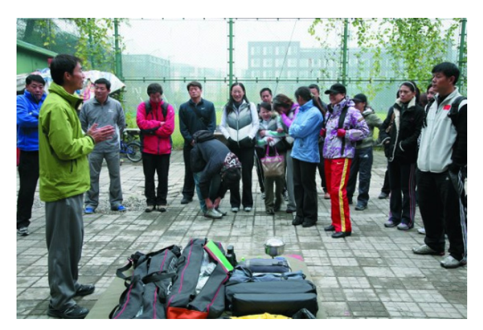
Fig. (2). Communication between teachers.