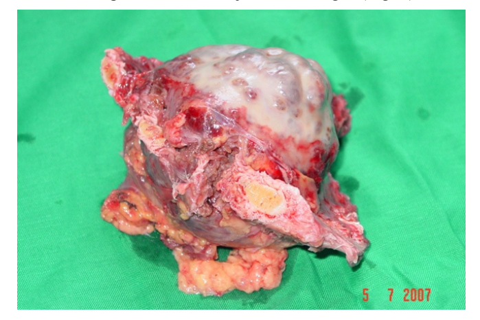
Fig. (2). Surgical specimen including one normal adjacent rib above and below the tumor with all intervening intercostals muscles and pleura and the adjacent cartilages.

resection of a generous margin of normal tissue around the neoplasm. The resection included one normal adjacent rib above and below the tumour with all intervening intercostals muscles and pleura and the adjacent cartilages (Fig. 2).