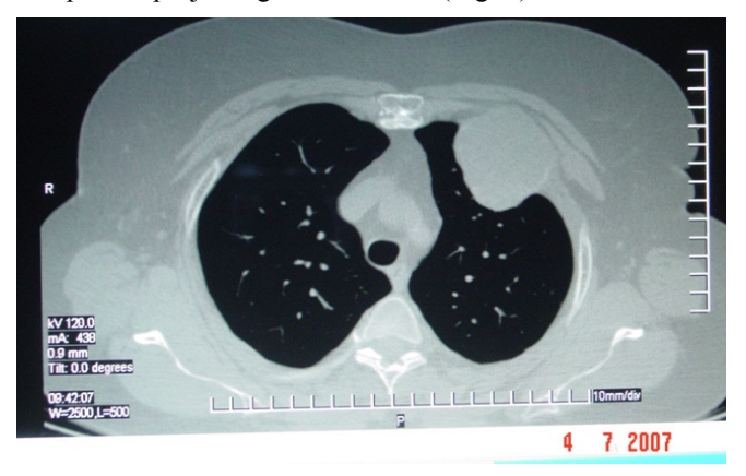
Fig. (1). Upper anterior left sided rib mass, with well defined margins, associated cortical erosion and no large soft tissue component projecting into the chest.

Both chest X ray and CT scan (2 weeks previously) revealed an upper anterior left sided rib mass affecting the second rib and the costochondral junction, with well defined margins, associated cortical erosion and no large soft tissue component projecting into the chest (Fig. 1).