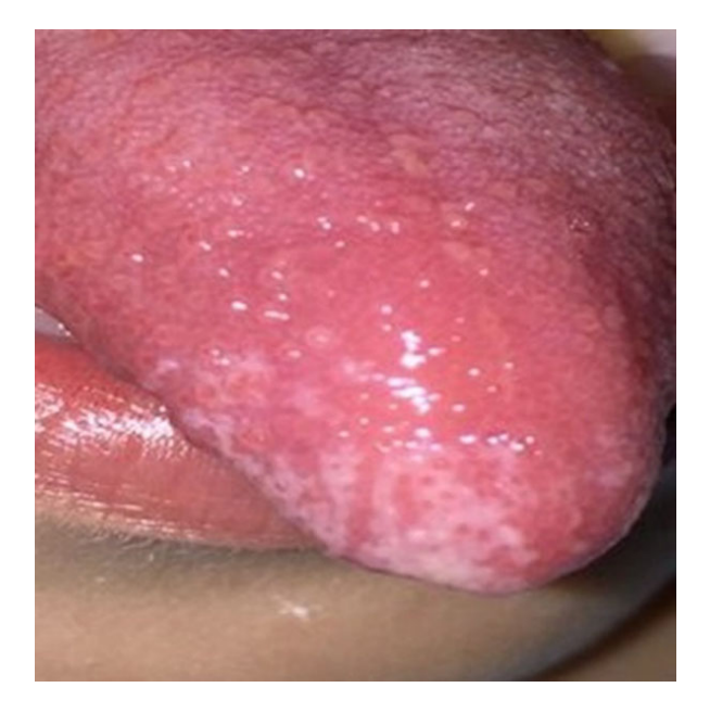
Fig. (2). White lesions on tongue, right side.