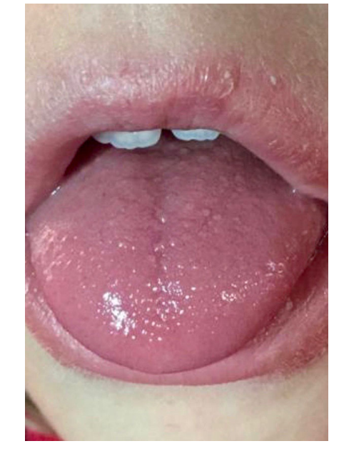
Fig. (4). Remission of injuries after treatment.

the results showed low serum iron values. Likewise, neurological tests and electromyography yielded normal results. A polysomnographic study revealed restless legs syndrome, and SCN9A gene sequencing showed no mutations in the area of study. Accordingly, pathognomonic findings and test results suggested a diagnosis of primary EM, in spite of the signs present in the oral mucosa, which are consistent with secondary EM.