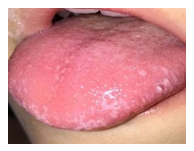
Fig. (3). White lesions on tongue, left side.

A complete blood count was performed, ruling out Fabry disease [20], secondary causes and rheumatoid conditions, and