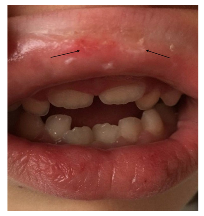
Fig. (1). Ulcerative lesions in labial mucosa.

These lesions usually heal within 3 to 5 weeks using a topical antiseptic agent (0.12% chlorhexidine) and a bioadhesive hyaluronic acid oral gel, because of their properties of repairing and regeneration of oral tissue. Analgesics (paracetamol) and nonsteroidal anti-inflammatory drugs (NSAIDs) i.e. ibuprofen are orally administered in episodes of intensification of the burning pain.