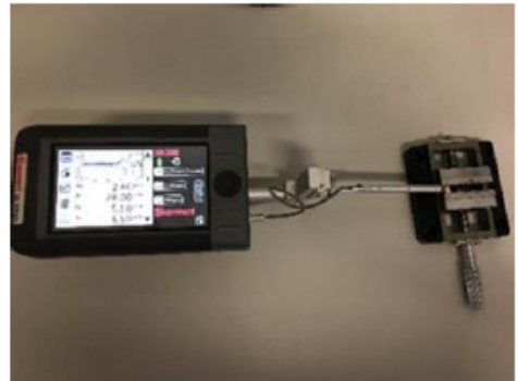
Fig. (3). The specimen was placed on the flat table surface, and a clamp was used to hold specimens stable in its position (A), the values of surface roughness were displayed digitally on the screen of the portable digital roughness (SR 300, Taylor Hobson, Leicester, England) (B).