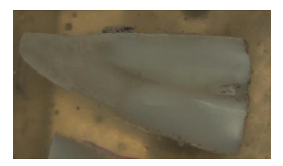
Fig. (1). Root section was embedded in self-curing acrylic resin, and the root canal dentin surface was facing up.

direction and obtaining mesial and distal sections. Each root section was embedded in self-curing acrylic resin; the internal surface of root canal dentin was faced up (Fig. 1). The surface was flattened sequentially with 600, 1000, 1500 silicon carbide papers. Subsequently, each specimen was tested using a Vickers Hardness Tester (Shimadzu HMV-2, Shimadzu Corporation, Kyoto, Japan) with a ten-gram load of indenter (15 seconds) (Fig. 2). Three indentations at a distance of 200 µm from each other were done on the apical third of each root [22]. The indentations were viewed on the computer screen connected to the micro-hardness tester. Three indentations then were averaged to determine the value of micro-hardness (in VHN) of each specimen. Data obtained were analyzed statistically using One-Way ANOVA and Tukey's test with a significance level of 95%.