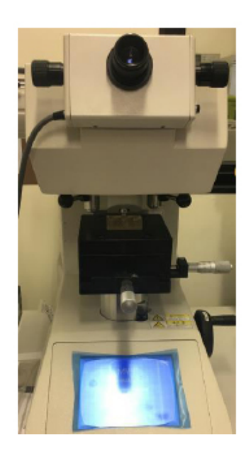
Fig. (2). The specimen was tested using a Vickers Hardness Tester (Shimadzu HMV-2, Shimadzu Corporation, Kyoto, Japan).