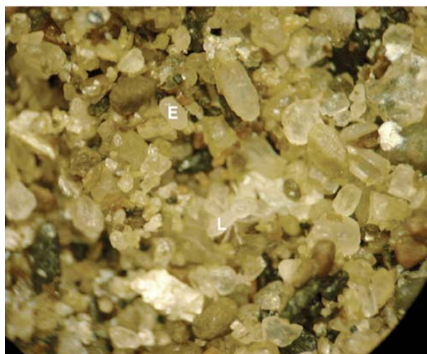
Fig. (3). Larva hatched out in 7 weeks from an egg laid by nymphoids which were fed filter paper with 0.10% norharmane. E, Egg. L, Larva.

creased because the effect of OTFP to inhibit JHE activity in homogenates of R. speratus was ~90% and thus ~10% of JHE activity remained in the termite homogenates. In nymph, soldier, and worker homogenates, seeming JHEH activity from the remaining JHE activity could account for most of the JHEH activity listed in Table 1 and thus norharmane did not significantly affect JHEH activity in these homogenates.