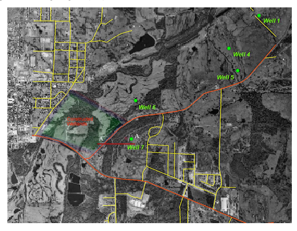
Fig. (1). Wetlands site, Greenwood, AR., 2007.

shorne Formation. These alternating layers of Pennsylvanian sedimentary rock vary in thickness from a few meters on the western up-thrust portion of the formation to depths of nearly 185 m at the water extraction point. The extensive Atoka sandstone formation is located beneath the Hartshorne [20].