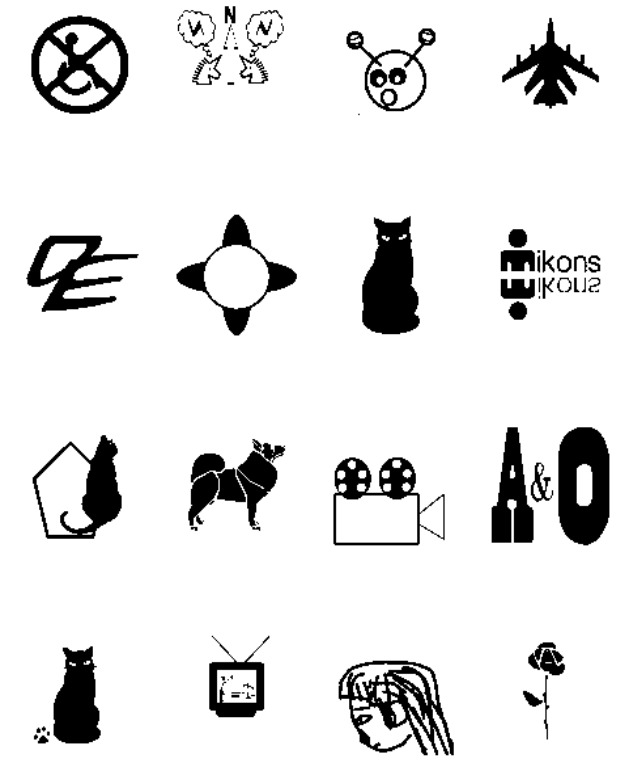
Fig. (3). A Collection of Mikons.