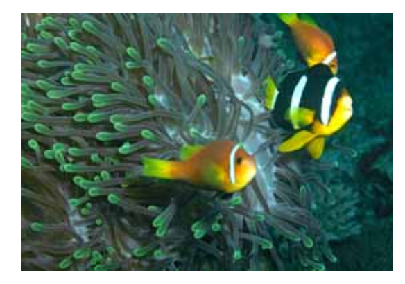
Fig. (3). Amphiprion clarkii and A. nigripes utilizing the same host anemone ( Heteractis magnifica ).

in an anemone of 1,250 \text{ cm}^2 at 15 m water depth. In case number two, 1 adult A. clarkii was observed with 2 adult, 1 juvenile size 3, and 1 juvenile size 2 of A. nigripes in an anemone of 940 cm<sup>2</sup> at a depth of 14.8 m. In case number three, 1 adult A. clarkii was found with 1 juvenile size 3 of A. nigripes in an anemone of 310 cm<sup>2</sup> at a depth of 14.5 m.