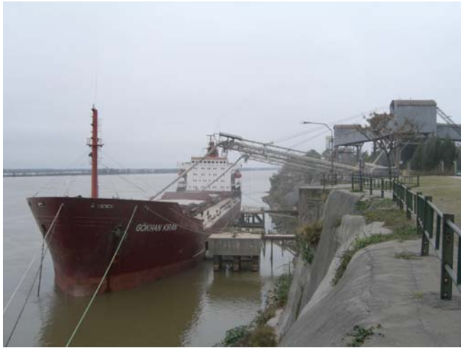
Fig. (4). Soy grains being loaded for export, Paraná River.

province of Santa Fe, close to key production areas and loading ports, which enables easy access to export markets (Figs. 1, 4). The privileged location of the industrial processing industry has increased the competitiveness of the soy value chain, which benefits from shared proximity to location-specific factors, including specialised human capital and infrastructure. Furthermore, the vertical integration and interdependence of actors in the soy production chain has led to the creation of this powerful 'soy cluster', the independence of which is attributed with enabling Argentina's interior to make a fast recovery from the 2001 economic crisis [26].