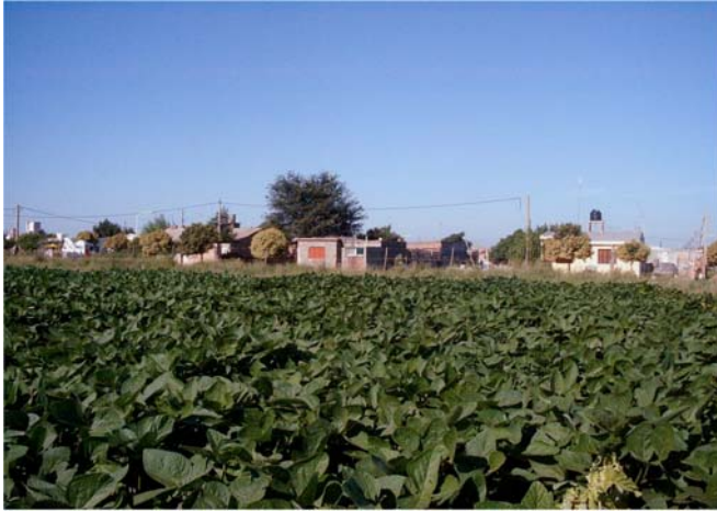
Fig. (2). Soy cultivation, Entre Ríos.

in separate and independent markets [37]. National and international demand for biodiesel has provided those involved in the soy industry (e.g. farmers, agribusiness and oilseed crushers) with another market opportunity, which has led to the rapid development of the biodiesel industry in Argentina (Fig. 2). Here we consider the production chain for Argentinean soy biodiesel, tracing it through feedstock cultivation, transportation, processing and conversion to export.