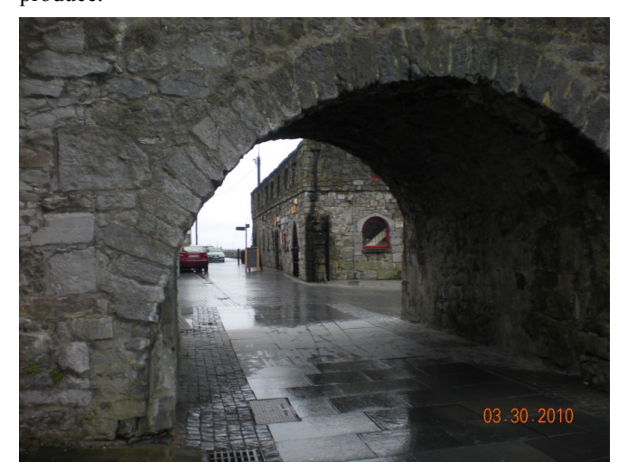
Fig. (6). Spanish Arch, built in 1584, represents historical influence of European trade with Ireland.

organic produce on the menu. Chef 5 worked in the longestestablished of the restaurants (opened in the mid-1990s) and referred to the higher quality of local produce, to supporting local producers economically and to the convenience of having local suppliers. Chef 6 paralleled Chef 1, in owning more than one business and holding strong philosophical ideas relating to local food. Chef 6 has an eclectic style that is reflected in the restaurant, which incorporates both Irish and international cuisine. Chef 7 who works in a restaurant owned by an investor in the food and drinks sector, previously worked with Chefs 1, 3 and 6 and holds a degree in hotel and restaurant operations, as well as professional qualifications as a chef. The restaurant conveys a non-formal ambience and attracts a young clientele in the late evenings. It has a greater emphasis on using organic produce than have the others and a mission to use exclusively Irish food produce.