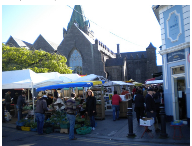
Fig. (3). Galway Farmers' Market is weekly, year around.

Galway has a well educated middle-class resident population with disposable income. It also has a developed tourist market and substantial demand for dining out, which is met by over 135 restaurants (there are also as many as pubs which serve food). A small number of these restaurants advertise their use of local produce and are recognized for doing so in national and international food guides.