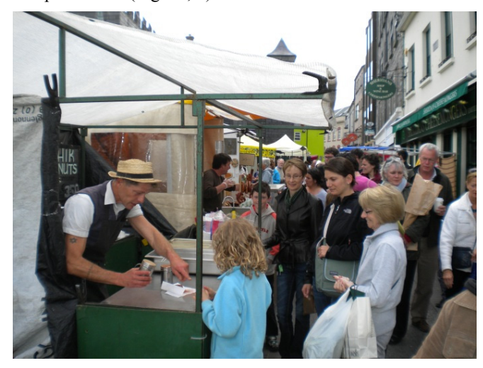
Fig. (2). Galway Farmer's Market with produce, artisan and local foods (here Donuts).

food products (air dried beef and lamb) are available. Connemara lamb from a mountainous area northwest of Galway City, holds a European Union (EU) Protected Geographical Indication (PGI) quality food label [48]. There are a handful of farm cheese producers and a small but growing number of organic vegetable and beef producers located in County Galway and in the adjoining counties of Roscommon and Clare. A traditional weekly farmers' market is frequented by a wide range of small scale food producers and processors (Figs. 2, 3).