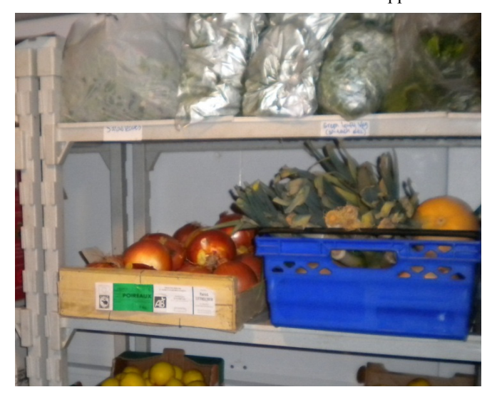
Fig. (8). Cold storage at restaurant includes both local "leaves" labeled on the top shelf and imported organic vegetables.

Some problems were identified associated with sourcing local produce, to which two responses emerged: replacement and adaptation. Additional cold storage was needed to compensate for less frequent deliveries of organic meat and vegetables by individual producers (Fig. 8). One chef referred to this factor and to price in rationalizing his shift from a local organic producer to a conventional wholesaler: "The larger multinational companies...could offer better prices, more discounts. We buy more from them now; better prices with same quality." (This contrasts sharply to other interviewees who felt there was clear superiority to local organic vegetables.) This same chef also said that sometimes he had to buy French- or Icelandic-caught fish in winter because of the non-availability of required species from Irish fishermen. By contrast, other chefs adapted their menu to the fish species that were available on a given day. Chef 7 referred to the sense of adventure in planning a menu in advance when aspiring to use local food: "At first I changed menu every day according to what we 'tripped over' in the boxes...cooking off the bat like that. That was brilliant...we did that for all of December and then it got to the 'like craggy months' of Winter" and they were forced to develop a set menu from more conventional wholesale suppliers.