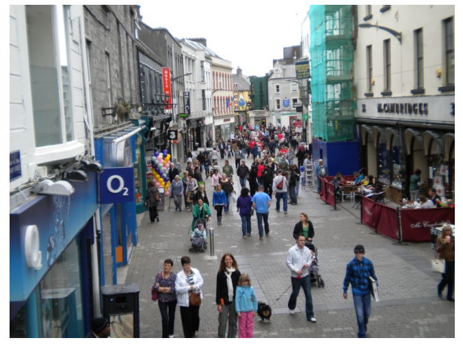
Fig. (4). Shop Street in Galway Ireland; all six surveyed restaurants are in close proximity to this main area of commerce.

Following review of recognized national food guides and the websites and menus of restaurants in Galway, six were identified which promote the use of local food in their kitchens (Fig. 4). Their seating capacity varied from 45-90 persons. Interviews were conducted with a key decision-maker in sourcing food in each restaurant: the owner, the manager, or the head chef. In one case both the owner and the chef were interviewed because they were jointly influential in determining the menu. All interviewees are referred to anonymously as Chef 1, Chef 2, etc., although several were managers or owners rather than chefs. The interview guide focused on the business profile and on the three research objectives. These components specifically allowed for gathering a broad range of information on chefs' perceptions and actions regarding local food, which illuminate the ways in which restaurants play a role in the development of local food value chains.