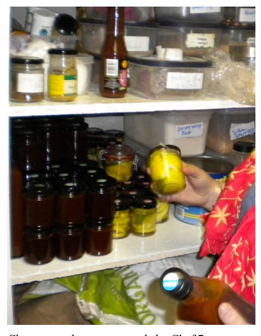
Fig. (7). Chutneys and preserves made by Chef 7.

West Cork [50]. Local was also extended to include artisanal produce from other European countries, an international dimension less well documented in published literature. Grains, lentils, chickpeas and wines were sourced through specialty importers. Thus Chef 7 described: "Flour is organic...buy in England if cannot get in Ireland...organic pasta...barley from the UK." Two restaurants imported wine through agents who dealt with specialty producers in Italy, Spain and New Zealand.