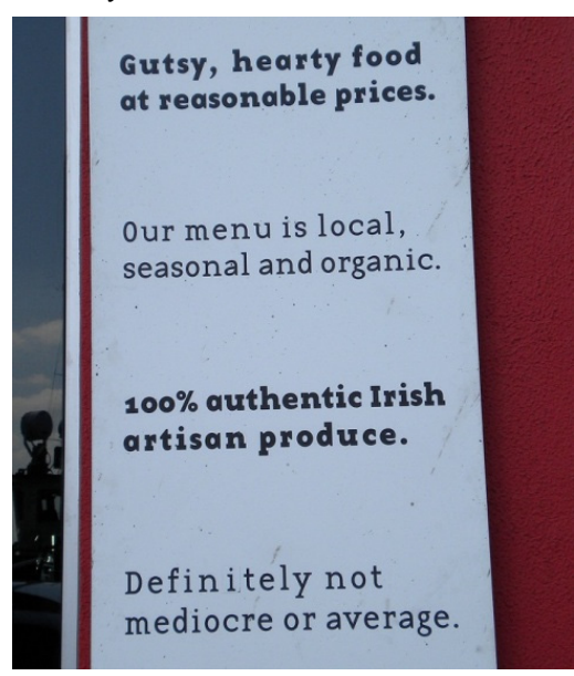
Fig. (5). Restaurant sign advertises their perceived importance of local and organic food.

Five male and two female chefs were interviewed. One was aged 45-54 years; the others were aged 25-34 years. Two held professional qualifications in cooking and in catering, respectively; the others held a range of other qualifications. With one exception, the restaurants were established in 2008-09, as economic recession was impacting in Ireland. This apparently inauspicious timing appeared to have been influenced by falling rents and properties becoming available. A deep interest in food, in local ingredients, and in demonstrating use of those ingredients were the reasons cited for opening and working in the restaurants, as described by one chef: "I wished to stay in Galway...to showcase food from round Galway. A lot of people are creating fantastic food and ingredients and no one is showcasing them in a proper way." (Fig. 5). The chefs are profiled briefly in order to contextualize the analysis of their narratives. They are numbered in order of interview.