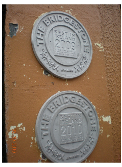
Fig. (9). Example of the award plaques which may be displayed if a restaurant owner pays a significant fee.