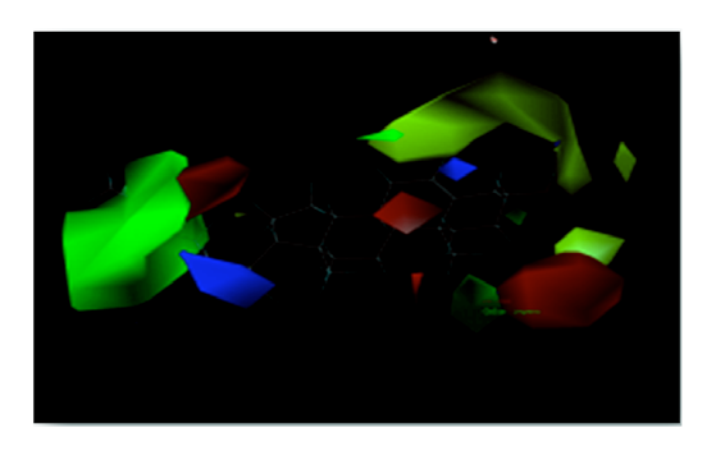
Fig. (2). CoMFA contour maps. In the steric contour map to the left, green contours indicate areas where steric bulk is predicted to increase antimycobacterial activity, while red contours indicate regions where steric bulk is predicted to decrease activity. The electrostatic contour map on the right displays yellow polyhedra where partial negative charge is correlated with antimycobacterial activity; the blue polyhedra indicating a relationship between partial positive charge and activity with bioactive compound Saringosterol .