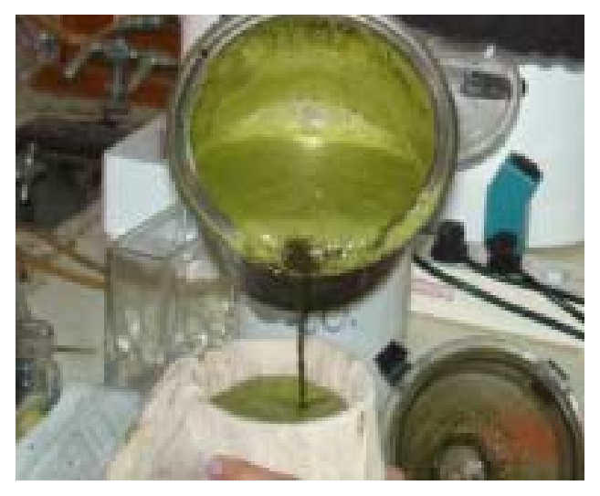
Fig. (2). Juice of Girardinia heterophylla Leaves.

The procedure for extraction of LPC, as suggested by Pirie in (1957) [10] was employed for the present study. 100g fresh and fully matured leaves were minced with water (1:9) in a mixer and squeezed using muslin cloth (Fig. 2). The extracts were heated at 80^{\circ} C for 8-10 minutes in a water bath to coagulate the protein. Each of the coagulated mass