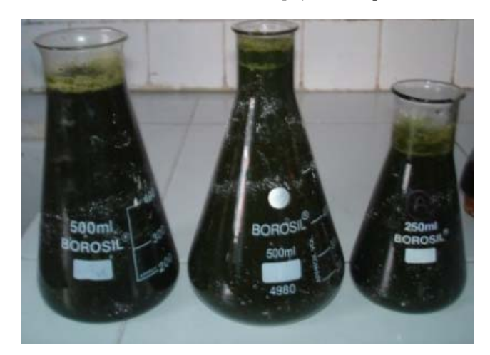
Fig. (3). Girardinia heterophylla Leaves- After Centrifugation.

LPC was analyzed for the assessment of percentage yield of nitrogen, protein, ash, fat and carbohydrate contents. It was observed that the amount of dry LPC recovered from Girardinia heterophylla was 8.00g per 100g fresh leaves. The data on yield expressed as amount of dry LPC recovered from 100g leaves and nitrogen (N %) content of LPC isolated from Girardinia heterophylla is presented in