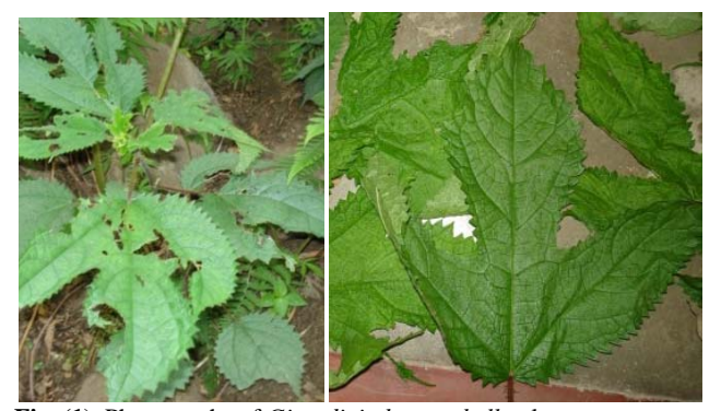
Fig. (1). Photographs of Girardinia heterophylla plant.

As evident from the contemporary literate and traditional knowledge, the plant has remarkable role in the day to day life of various ethnic groups/ tribes of Uttarakhand. These forest dwellers have been using different parts of plant for their livelihood as well as health and other domestic purposes. The leaves of this plant are boiled and cooked for vegetables and also for preparing traditional recipes by the local forest dwellers [4]. Leaves are also a good source for protection against neoplastic, cardiovascular disorders and