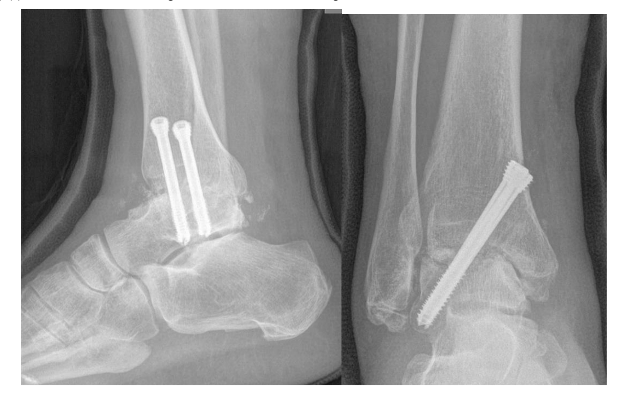
Fig. (5). Non-weight bearing AP and lateral radiographs two weeks after AAA with two parallel HCS compression. Note distal HCS threads are within lateral talar process and proximal covered in thinner medial tibial cortex causing any impingement on soft tissues.