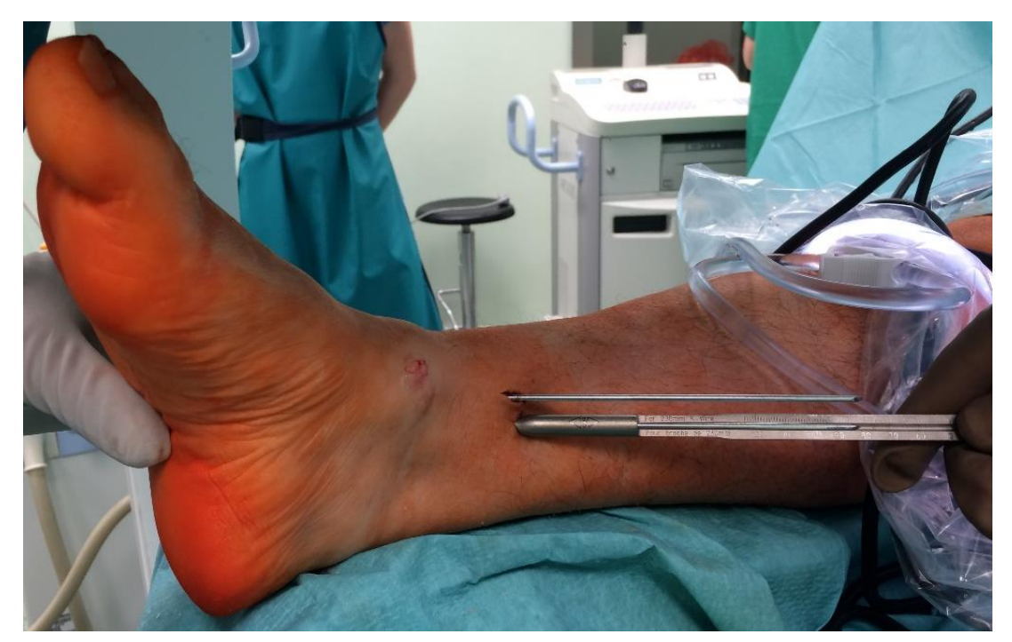
Fig. (2). Precise measurement of the screw length. The K-wires were withdrawn on the medial tibia until they were completely flush with the lateral talar process, which can be checked by finger palpation and/or C-arm control. This step allows for very precise measurement of the screw length over the K -wire.