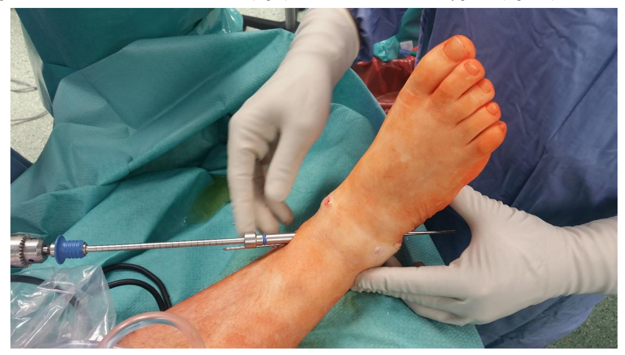
Fig. (3). Antegrade drilling with soft tissue protector inserted. Note the K-wires are pushed back down again and extend from wound on the lateral side. That manoeuvre serves as a backup and helps to remove K-wires in case they brake or bent while using cannulated drill.

A stab incision was performed around the K-wires to the medial tibia, a soft tissue protector inserted, and cannulated drill introduced from the tibial medial cortex into the talus. A 7.3-mm cannulated HCS was introduced to the point that the entire head was inside the cortex (Fig. 3). Two HCSs were used in every patient (Figs. 4-6).