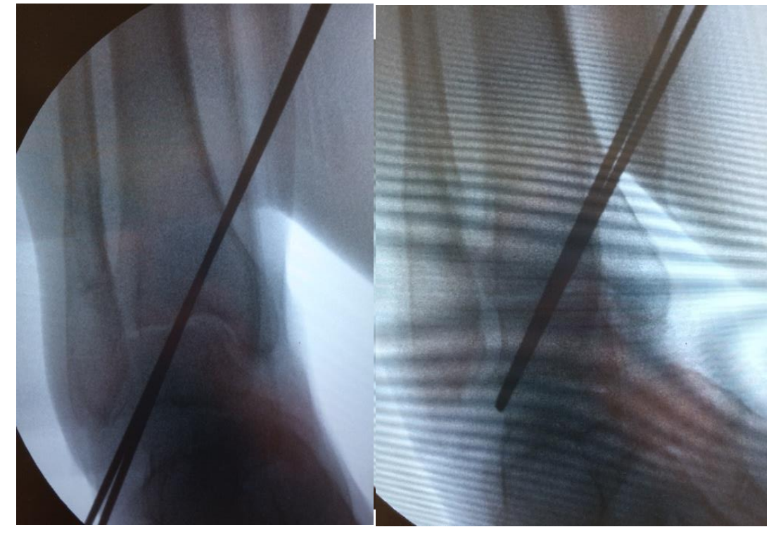
Fig. (1). C-arm view of the right ankle with two parallel K-wires introduced from lateral talar process across debrided ankle joint in Step 1 of the procedure (left). K-wires are then withdrawn with the power drill on the medial side, until they are completely flush with the lateral talar process, what can be checked by a finger palpation and/or C-arm control in Step 2 (right).

The K-wires were withdrawn with the power drill on the opposite side of the medial tibia until they were completely flush with the lateral talar process, which can be checked by finger palpation and/or C-arm control (Fig. 1). This step allows for very precise measurement of the screw length over the K -wire. After measuring the screw length over the K-wire (Fig. 2), the K-wires were pushed back with the power drill again to stick out from the talus entry points. This maneuver serves as a backup and helps remove K-wires in case they break or bend while drilling with a cannulated drill or during final screw insertion.