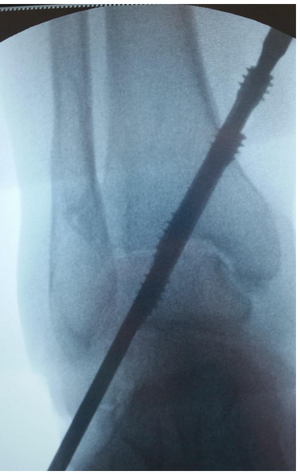
Fig. (4). C-arm control while inserting second HCS. Both screws are tightened and buried inside medial tibial cortex.