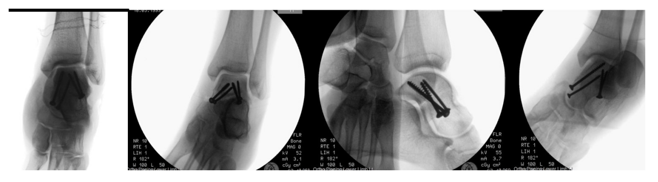
Fig. (9). Final intra-operative radiographs showing excellent reduction and compression at the fracture site.