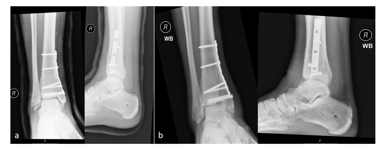
Fig. (6). (a) AP and lateral postoperative x-rays on the 2^{nd} day showed good reduction and alignment. (b) Follow up x-rays at one year showed healing of the fracture and moderate post-traumatic osteoarthritis.

Fig. (5). Intraoperative X-rays confirm accurate reduction and the correct position of the plate and screws. Gaps in the articular surface and the posterior cortex due to comminution and bone loss were observed as the overall alignment was anatomical.