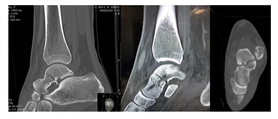
Fig. (7). Sagittal and coronal images from the CT scan showed a talar body fracture with medial comminution and a loose articular fragment impacted in the fracture site.

the maintenance of reduction and no prominence of metal work (Fig. 8). Final intra-operative radiographs are shown in Fig. (9). Each image acquisition with the O-arm took under 4 minutes. The limb was placed in a below knee splint in neutral ankle position, which was changed to a full below knee cast two weeks later after the swelling had subsided completely and the wound was dry and healthy. The patient remained immobilized and non-weight bearing for 6 weeks postoperatively. She remained non-weight bearing in a boot that allowed ankle range of motion exercises for an additional six weeks. The fracture healed uneventfully without early signs of arthritis or avascular necrosis at one-year post-operative (Fig. 10) and she had an AOFAS score of 95.