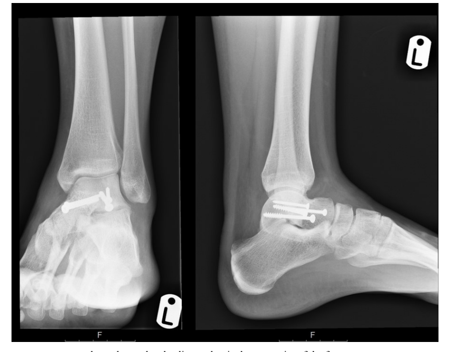
Fig. (10). Follow up x-rays at one year showed complete healing and articular congruity of the fracture.

The O-arm offers an intra-operative cone beam CT scan with high quality, linked multiplanar images that can be actively scrolled, as well as 3D reconstructed images. There is literature on the previous attempts at 3D imaging in trauma, primarily using the Siemens ISO-C3D<sup>TM</sup> system (Siemens, Erlangen, Germany). However, this system and similar ones are actually an extension of fluoroscopy and are based on multiple plane x-rays. These fluoroscopic systems had several disadvantages: a higher dose of radiation, small field of view, low quality and a spin range of 190 degrees with the remaining arc being a fabricated image [23]. All of these factors affected the ultimate functionality of the ISO-C3D system. That said, it still proved to be superior to simple fluoroscopy and certainly eluded the potential benefits of intra-operative cone beam CT scanning.