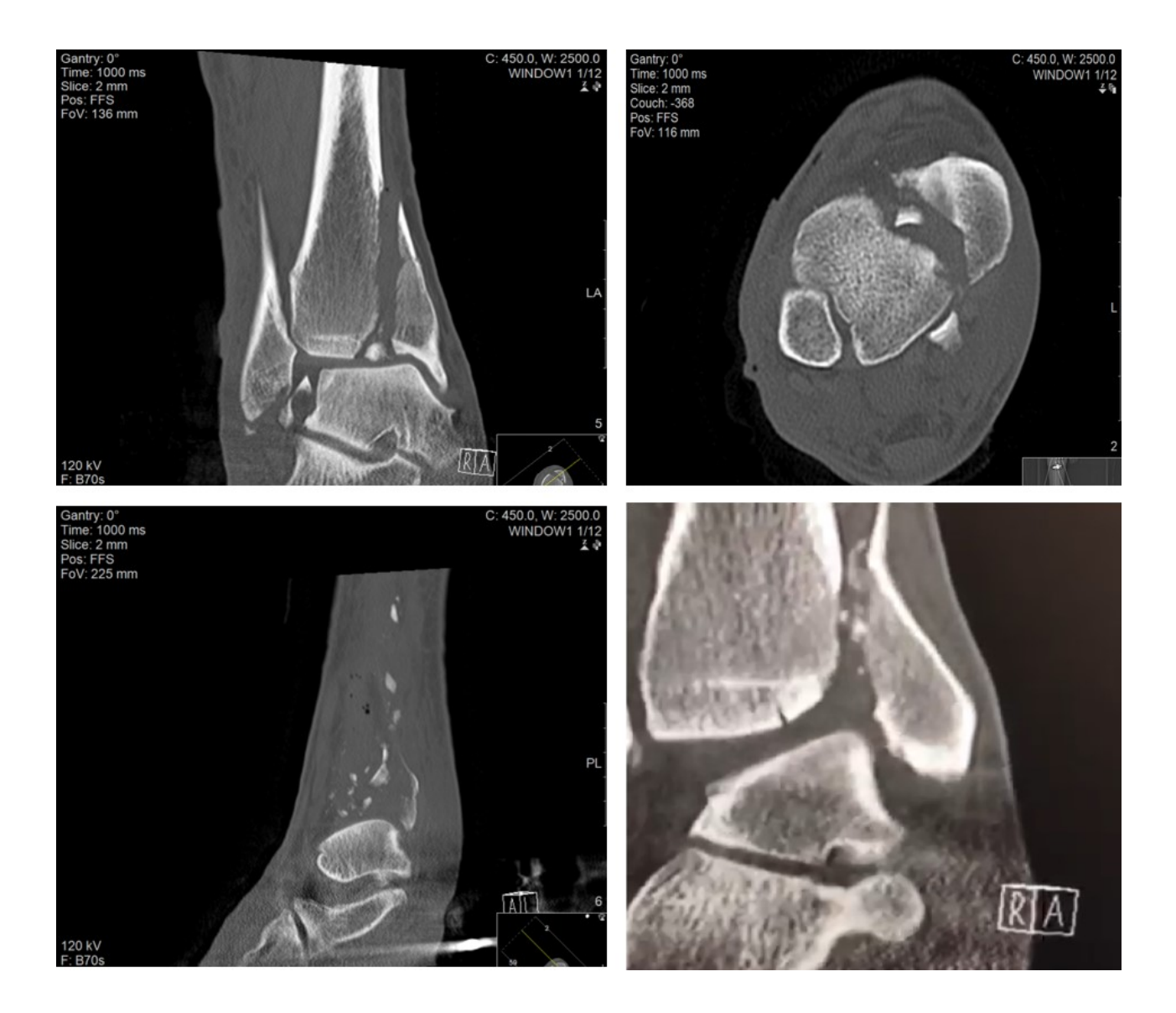
Fig. (2). Images from post-frame CT showing comminuted nature of the fracture, the articular impaction and multiple incarcerated fragments within the vertical shear fracture of the medial malleolus.