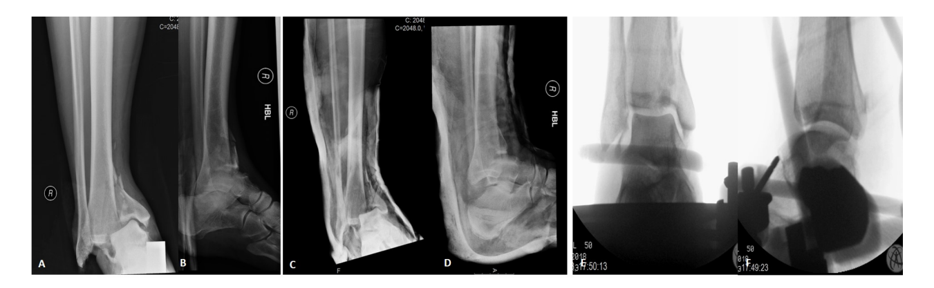
Fig. (1). (A & B): initial radiographs on presentation in the emergency department, showing a comminuted fracture-dislocation of the right ankle. There was a sagittal shear fracture of the medial tibial plafond with anteromedial dislocation of the talus; (C & D): ongoing dislocation of the right ankle despite multiple reduction attempts in the emergency department; (E & F): intra-operative radiographs showing final reduction achieved with external fixator applied.