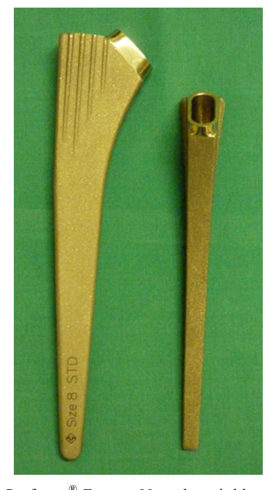
Fig. (1). The Profemur<sup>®</sup> E stem. Note the grit-blasted surface, the proximal ribs and at the lateral view the tapered, rectangular cross-section. The latter two features provide improved initial rotational stability.

A collarless, streamlined, tapered modular stem (Profemur<sup>®</sup> E stem, Wright Medical Technology Inc., Arlington, TN) made of Ti6Al4V alloy was used in all patients. The stems have a grit-blasted surface (Ra = 6micron) and a rectangular cross-section for enhanced rotational stability [12]. They are available in 10 different sizes (Fig. 1). The Profemur<sup>®</sup> E stems utilize a patented modular neck technology. Eleven options of neck orientation are available from five different designs (Fig. 2). These five neck versions include a neutral neck, an 8° angled neck for varus or valgus, an 8° angled neck for anteversion or retroversion, a 15° angled neck for anteversion or retroversion, and a neck with a combination of 4° for varus and 6° for anteversion. The latter double-angled neck can provide varus-anteversion, valgus-retroversion, varusretroversion and valgus-anteversion orientation, depending on the side implanted (Fig. 3). Each of them can be in short or long configurations, so the available options are 22. The Conserve<sup>®</sup> (Wright Medical Technology Inc., Arlington, TN) CoCr cup, without metal liners and holes or screws, was used as acetabular component in all cases.