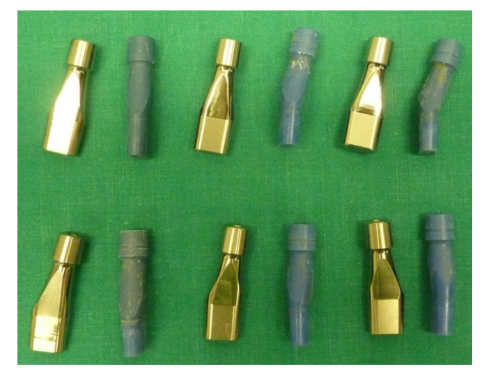
Fig. (2). The available neck types, each coupled with the plastic blue trial. In the first row, from left to right: the straight neck, the 8^{\circ} angled neck for anteversion or retroversion (Ante/Retro 8^{\circ} ) and the similarly 15° angled neck (Ante/Retro 15^{\circ} ). In the second row, the 8^{\circ} varus or valgus neck is shown first. The next two are actually the same neck version, designed separately for the right (ARVV1) and the left hip (ARVV2), so as to provide the combination of 4^{\circ} varus and 6^{\circ} anteversion in each side.

senior author, in a single unit and with the abovementioned specific implants and MoM articulation. A standard posterior surgical approach was used in all cases. Implant type, size, neck, and head were selected according to preoperative planning and intraoperative axial and rotational stability and impingement testing. These implants were accurately recorded. A closed suction drainage was used in all cases. Postoperatively, antibiotic prophylaxis (cephalosporin) was used for two days until the removal of the drainage. Routine prophylaxis was not provided for the prevention of heterotopic ossification. Low-molecular-weight heparin was administered for six weeks together with compression stockings. Partial weight-bearing was encouraged for six weeks and progressed to full weight-bearing as tolerated thereafter.