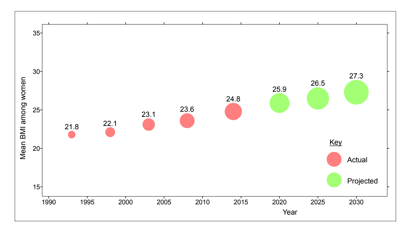
Fig. (1). Actual and projected mean BMI (kg/m<sup>2</sup>) of Ghanaian women (15-49 years).