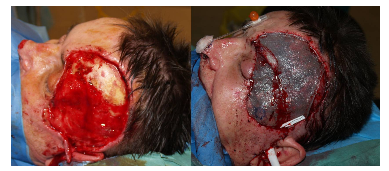
Fig. (2). Microvascular contralateral temporal fascia flap with eyebrow to reconstruct defect from a resection of a supraorbital SCC [9].

PNS can occur even in the setting of small isolated primary cutaneous SCC [4, 6]. It is the rule that the primary lesion is usually treated, and there is no superficial sign of