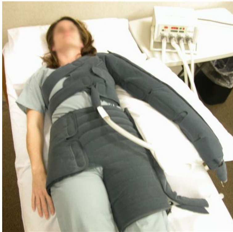
Fig. (1). Flexitouch system.

compression garment (JOBST® Elvarex®, BSN Medical, Charlotte, NC). Despite her diligence her lymphedema continued to worsen and her limb volume increased. Her ability to perform self-MLD was hampered by the development of tendonitis in her right thumb. By August 2005 her right arm limb volume was 46% greater than that of her left arm. In addition she had developed fibrosis of her right forearm. She was treated with a second 4-week course of intensive CDT at Washington Hospital Lymphedema Services. After 1 week of CDT, an in-clinic trial of the FT system was added to her therapy. After only 2 sessions incorporating treatment with the FT system, her fibrosis had softened considerably. At the end of the intensive 4-week program, the patient's condition plateaued at an 18% limb volume differential. She was re-instructed in a home therapy program consisting of self-MLD, gradient compression bandaging, therapeutic exercise, and diet, and was fitted with a second custom compression garment (JOBST® Elvarex®, BSN Medical, Charlotte, NC).