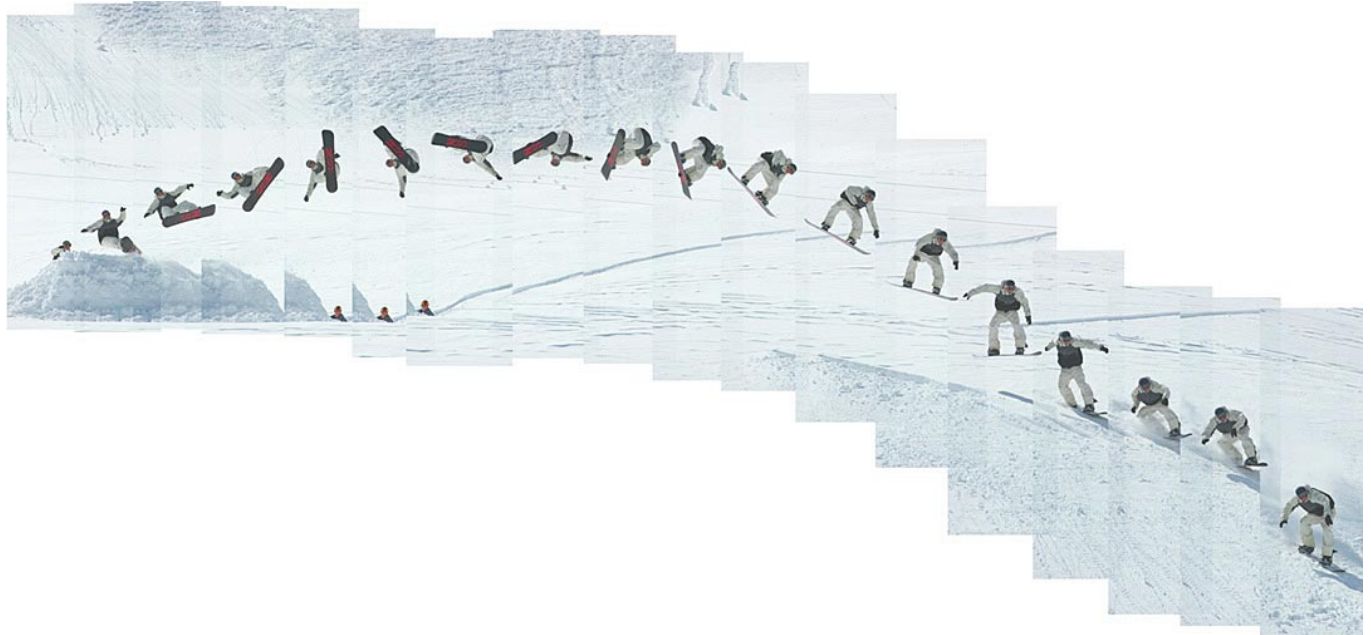
Fig. (2). Front 5° Melon trick off a backcountry jump. Melon Grab (front hand grabbing the heel-side edge behind the front foot and spinning 540deg counter clockwise).

is a skill-based event requiring significant kinaesthetic awareness and the absorption and generation of force in a variety of “uncommon” anatomical positions. Riding positions incorporate significant knee internal rotation and adduction and ankle pronation. From an injury and conditioning perspective, landings occur from large heights