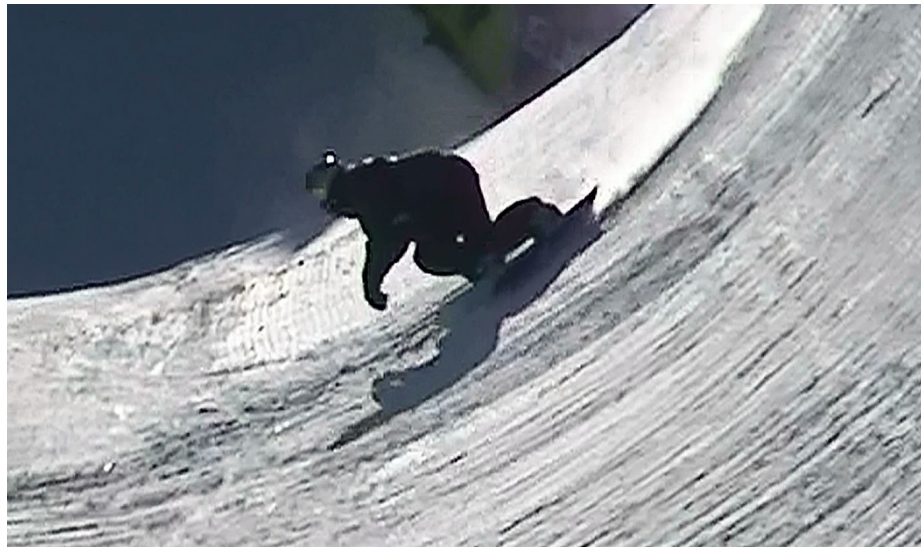
Fig. (6). Snowboard rider showing landing pattern typical of the ideal performance stance. Note the significant knee and ankle flexion and internally rotated back knee.

flexion may increase the risk of non-contact ACL injuries through ineffective hamstring contraction [31].