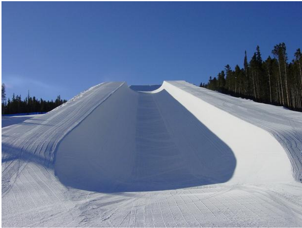
Fig. (1). Photographic and Diagrammatic Representation of a Snowboard Halfpipe. Halfpipe usually have a fall line gradient of 15-200. For the purposes of this review the Transition will be split in to the Eccentric Transition, where the rider drops into the pipe and sustains forces, and the Concentric Transition where the rider prepares to takeoff from the pipe sustaining isometric and/or concentric forces.