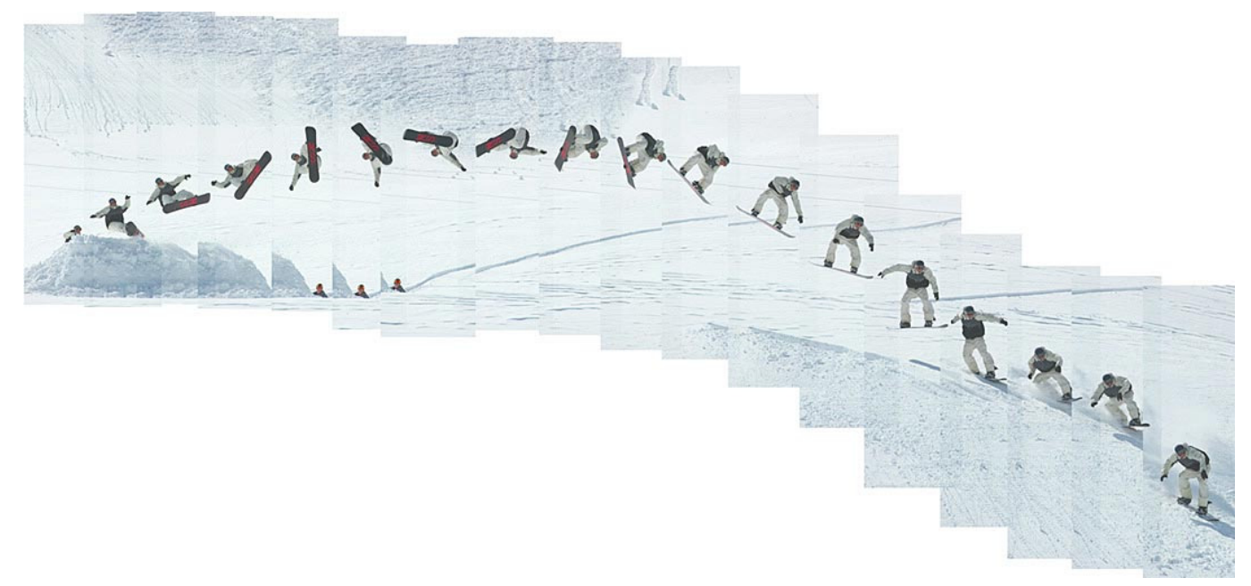
Fig. (2). Front 5' Melon trick off a backcountry jump. Melon Grab (front hand grabbing the heel-side edge behind the front foot and spinning 540deg counter clockwise.

Fig. (1). Photographic and Diagrammatic Representation of a Snowboard Halfpipe. Halfpipe usually have a fall line gradient of 15-200. For the purposes of this review the Transition will be split in to the Eccentric Transition, where the rider drops into the pipe and sustains forces, and the Concentric Transition where the rider prepares to takeoff from the pipe sustaining isometric and/or concentric forces.