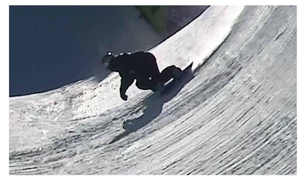
Fig. (6). Snowboard rider showing landing pattern typical of the ideal performance stance. Note the significant knee and ankle flexion and internally rotated back knee.

flexion may increase the risk of non-contact ACL injuries through ineffective hamstring contraction [31].