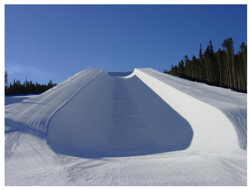
Fig. (1). Photographic and Diagrammatic Representation of a Snowboard Halfpipe. Halfpipe usually have a fall line gradient of 15-200. For the purposes of this review the Transition will be split in to the Eccentric Transition, where the rider drops into the pipe and sustains forces, and the Concentric Transition where the rider prepares to takeoff from the pipe sustaining isometric and/or concentric forces.