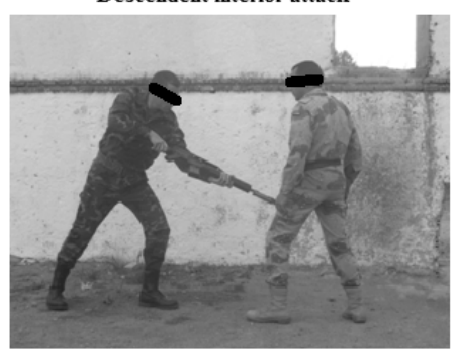
Fig. (2). Most used techniques.