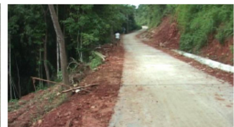
Fig. (1). Conditions of transport infrastructure of Dong Nai province.