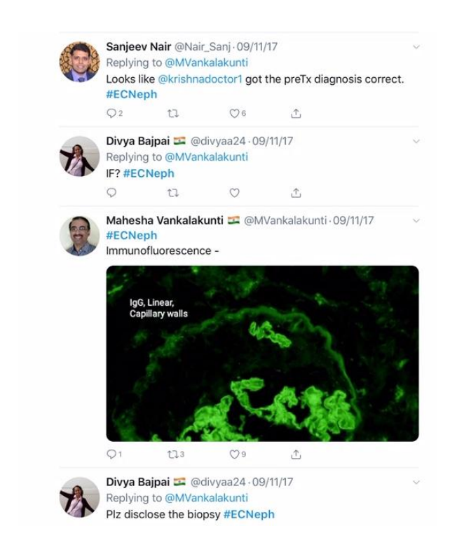
Fig. (2). Picture grab of an #ECNeph Twitter discussion

Here is an example of one such case that generated a heated discussion on Twitter, a case of Alport Disease with post-transplant graft dysfunction, and that case has been included in this series Fig. (2).