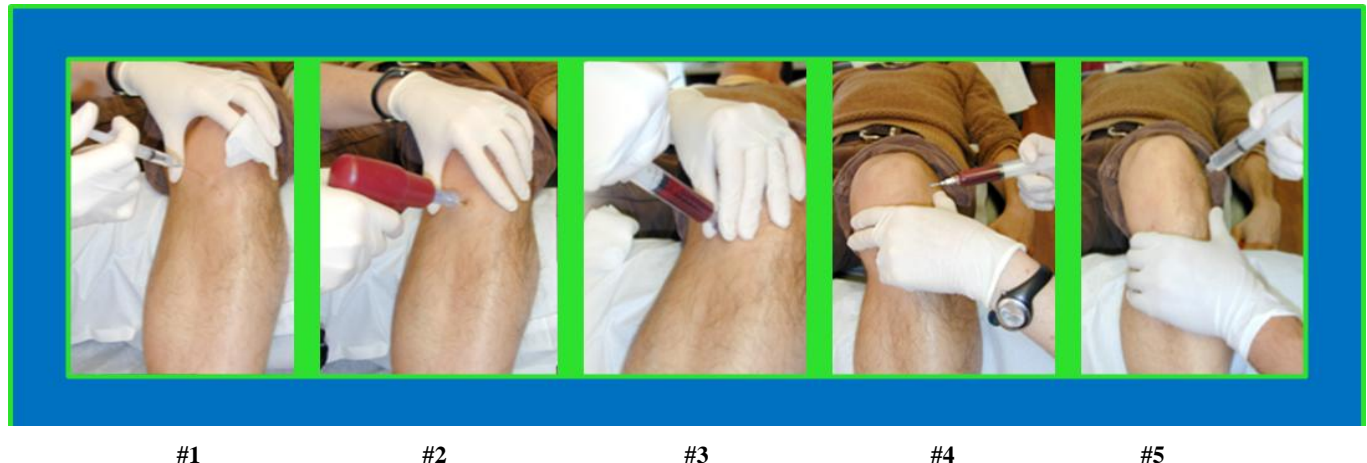
Fig. (1). Procedure for direct bone marrow prolotherapy

For knee prolotherapy, patients remained in the supine position and 1 cc of 8% procaine was injected intra-articularly into the index knee, followed by an injection of 4 cc 1% procaine solution into the primary sites of pain where the bone marrow was to be injected. The anterior aspect of