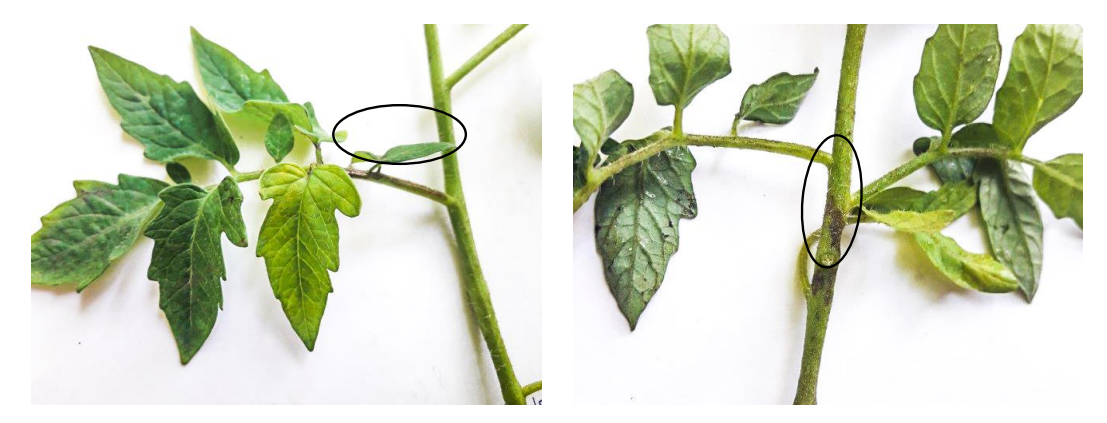
Fig. (2). Tomato plants stems artificially inoculated with bacteria isolated from the plants affected by soft rot.