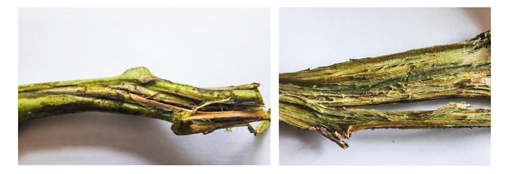
Fig. (1). Tomato plant stems with soft rot lesions (natural infection).

The bacterial samples were taken from the rotting stems of tomato plants on edge between the affected and healthy tissues (Fig. 1). Bacteria isolated from the affected plants formed colonies of white to cream colour on the potato agar. Most isolates did not cause maceration of potato disks, neither did they form dry rots. The gram-negative motile rods that could metabolise glucose under anaerobic conditions and cause maceration of potato pieces, specifically the appearance of brown watery spots at the site of application, were selected for subsequent research.